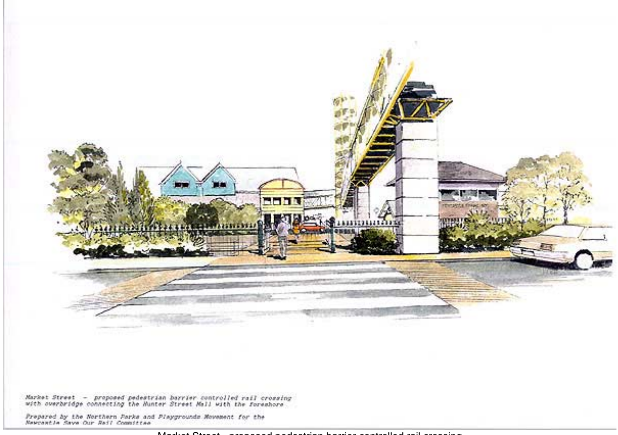
Market Street - proposed pedestrian barrier controlled rail crossing with overbridge connecting Hunter Street Mall with the foreshore

It is not possible to force people to travel by public transport. Most public transport users do so because it is their only option or because they are too old to drive or have no car or are young, unemployed or have disabilities. On the other hand intercity commuters as well as car drivers use CityRail services and there is opportunity for promoting increased travel to Newcastle by rail.