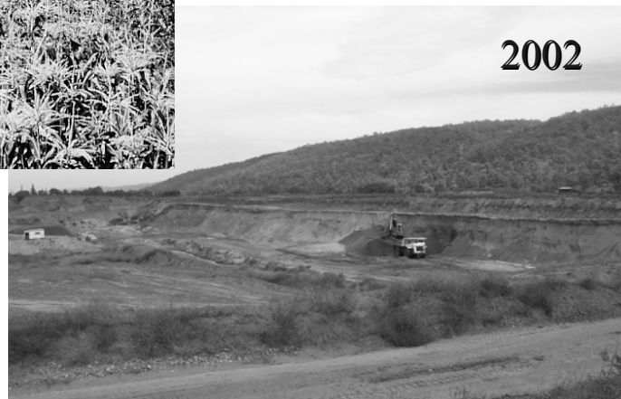
Figure 2 Mining of Sand and Gravels Along the Hawkesbury/Nepean valley

Loss of prime agricultural land to resource demands of development