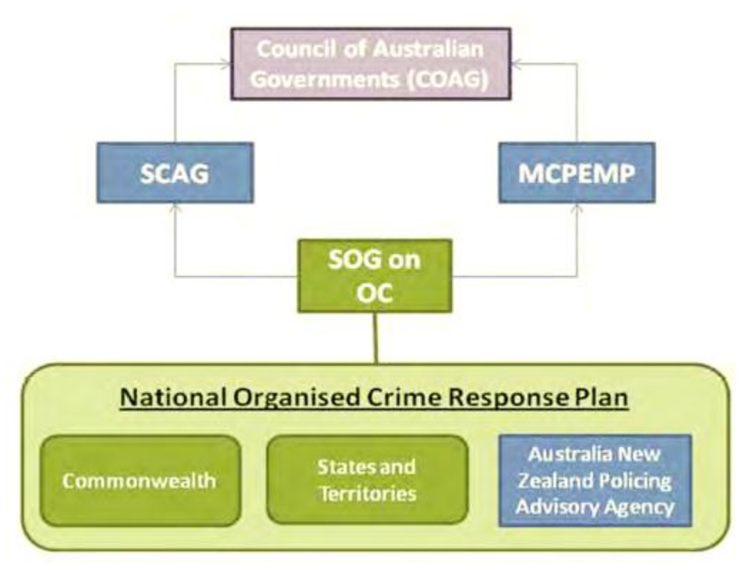
Figure 1: Reporting and governance structure: SOG on OC and the National Response Plan