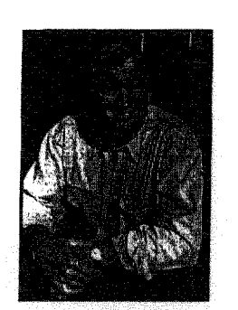
"Strengthening New England"

PO Box 621 150 Rusden Street ARMIDALE NSW 2350