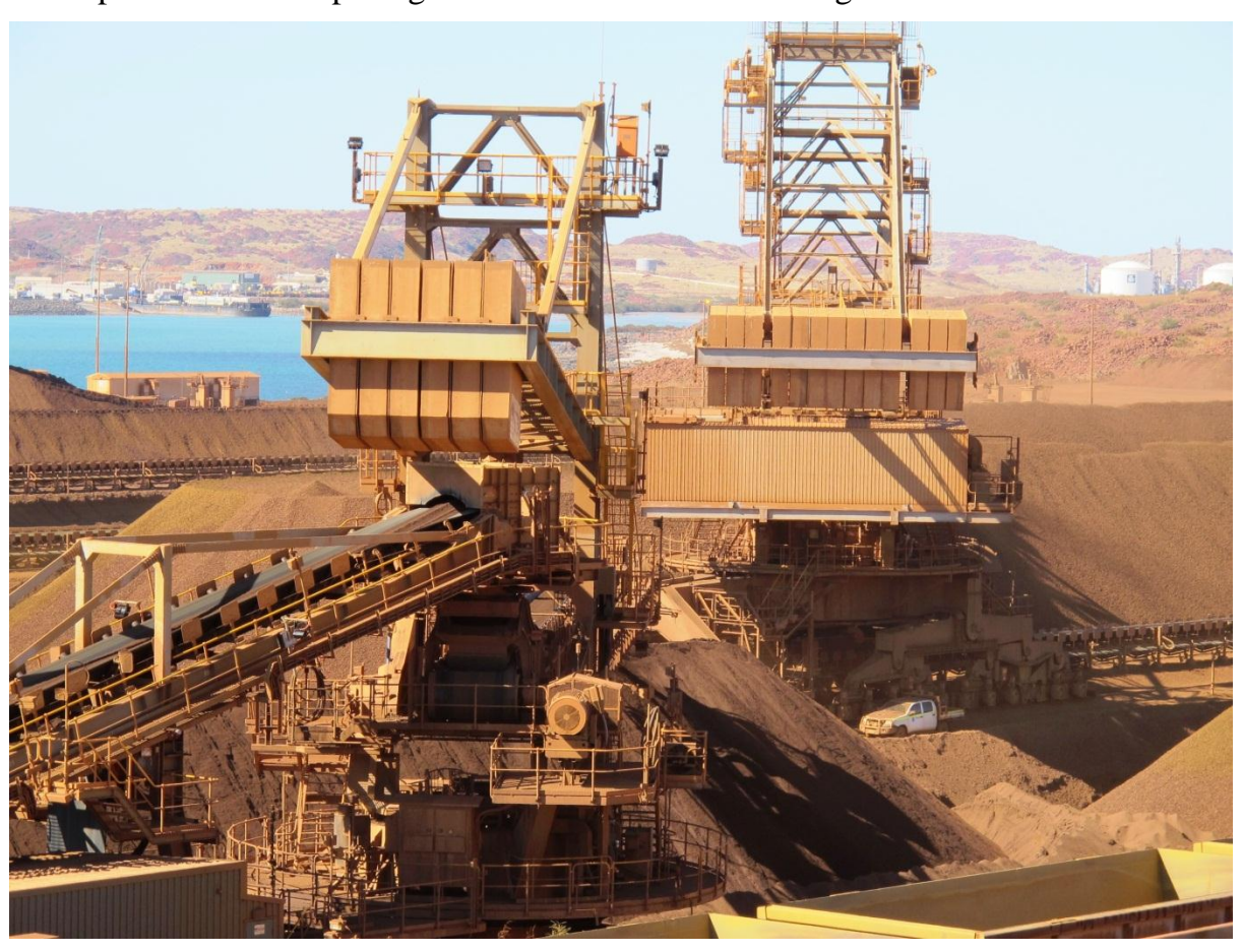
Iron ore being mixed prior to shipping.

12.13 The sheer amount and value of the exports leaving from the Pilbara highlight the importance of safe passage of these commodities through the Indian Ocean.