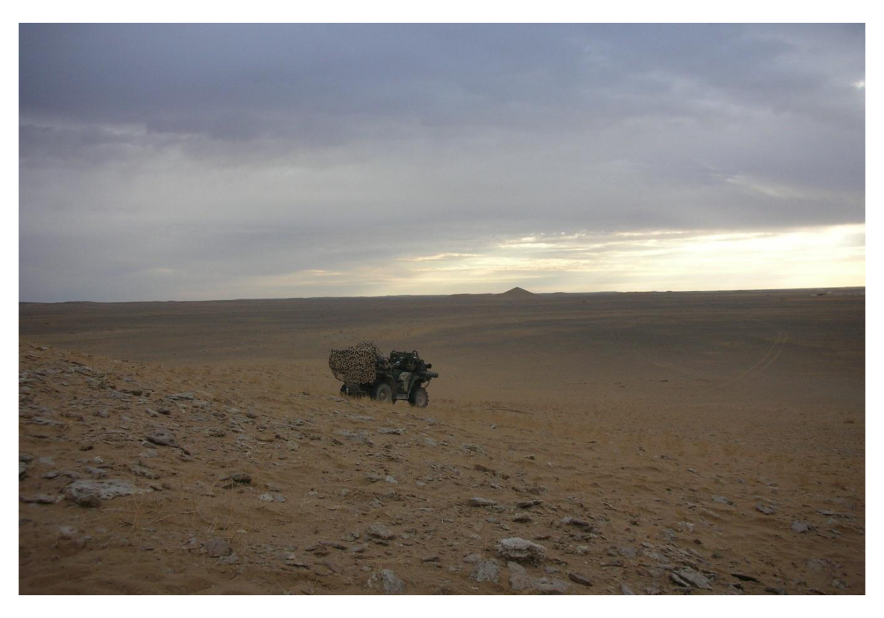
Remoteness and insecurity are two of the many challenges for organisations seeking to deliver development assistance to Afghan communities.