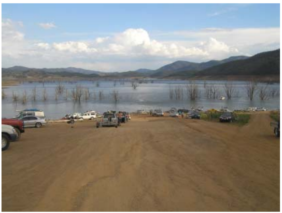
Lake Eildon boat launch area at Gough's Bay, 2008, at about the same level as now.

He wants his children to enjoy similar things. He knows that Lake Eppalock (near Bendigo) is virtually empty and wants to know if Eildon will be the same. He warns that he will have to take his children elsewhere to boat.