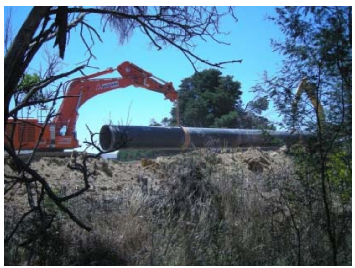
1.75 m diameter pipe currently being laid from Yea out of the Murray Darling Basin to Melbourne's Sugarloaf treatment reservoir

At least three public opinion polls in the regional areas of Victoria and at least one including Melbourne TV viewers showed 95% or more against this pipeline.