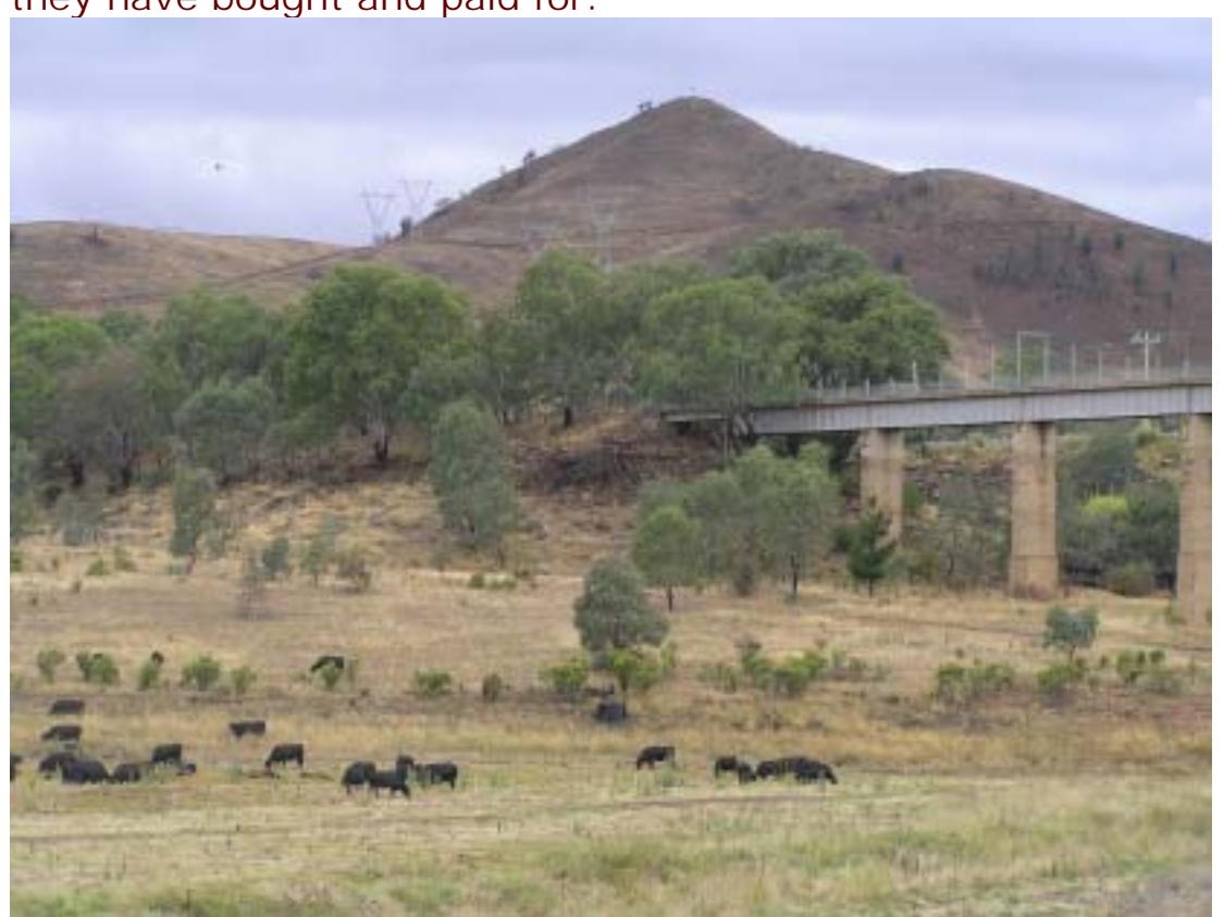
Lake Eildon at Bonnie Doon in February 2008. It's similar now.

Lake Eildon this week is at 19% capacity with 220 Ml per day running into it and 5,000Ml per day running out. Irrigators in the Goulburn Scheme have just had what used to be called their "Secure Water" rights available raised to 28% of what they have bought and paid for.