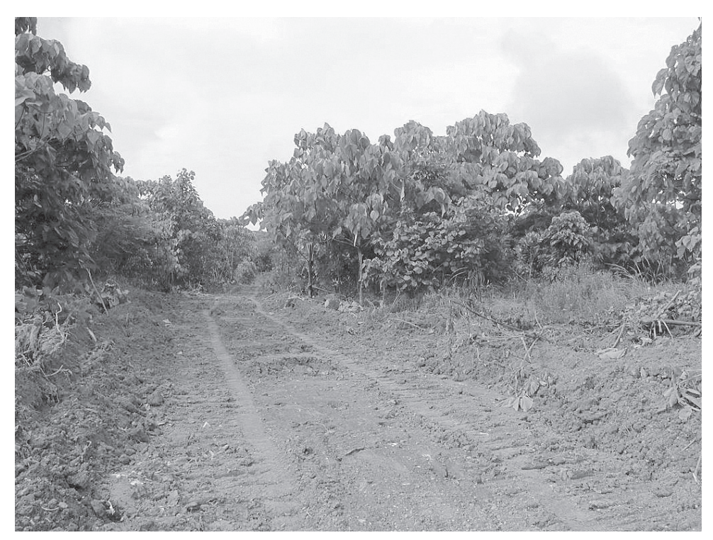
Close up view of bulldozer track through the rehabilitated area on Christmas Island.