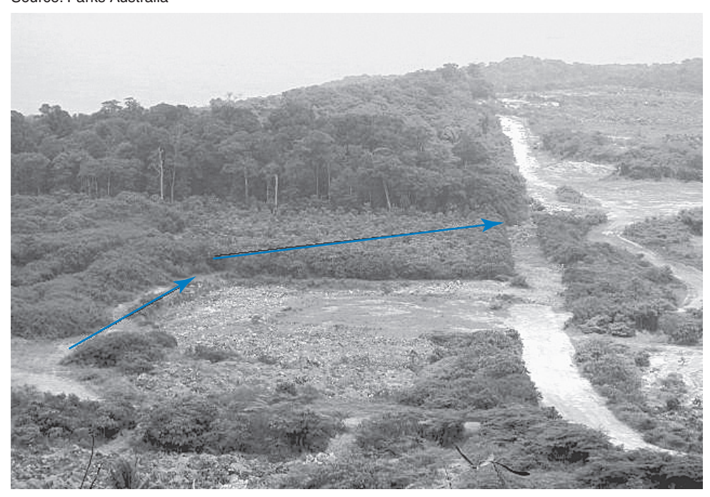
Aerial view of the site. The arrows indicate the bulldozer track. This action has essentially cut the block of rehabilitated land in half. The area of primary forest is immediately behind the site.