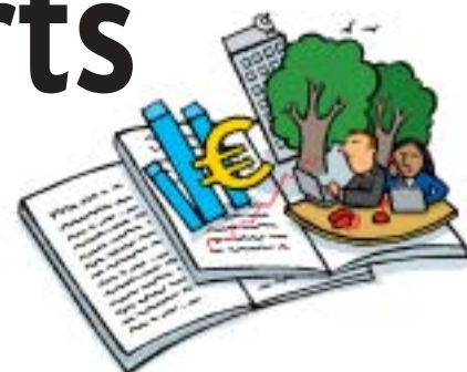
Figure 1: Spread of earnings estimates generated by investors

This outcome may be understood through a closer examination of the earnings estimates generated. From Figure 1 it can be seen that the degree of consensus surrounding the forecasts generated by the two groups varied greatly. Those with the full set of supporting non-financial