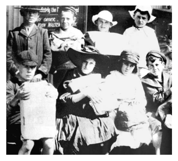
Children receiving outdoor relief parcels, 1906

In 1917, when Scarba House was opened as a residential care facility, The Benevolent Society was already over 100 years old. The Society had concerned itself with what were considered to be the burning social issues of the 19<sup>th</sup> and early 20<sup>th</sup> centuries, and had concentrated on such activities as providing 'outdoor relief' and accommodation for those in need, including at the Benevolent Society Asylum which operated from 1821 to 1901 on the site of what is now Central Railway Station. The Society had always focused on providing services for women and children.