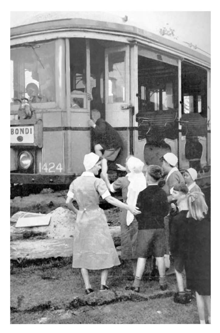
Nurses and children at Scarba watch the installation of a tram car donated by the Transport Department as play equipment, circa 1957

Furthermore, the late 1960s saw the cessation of child migration. The abolition of the NSW Aborigines Welfare Board brought with it an end to the assimilation practice of systematically removing Aboriginal children from their families. However, Indigenous children are still over represented in both the child welfare and criminal justice systems.86 In the early 1970s a recognition of the social inequalities faced by Indigenous people led to the establishment of Aboriginal childcare agencies. Aboriginal people were included in decision-making processes affecting Aboriginal children and those in need of substitute care were to be placed with their extended family or within their own community.87