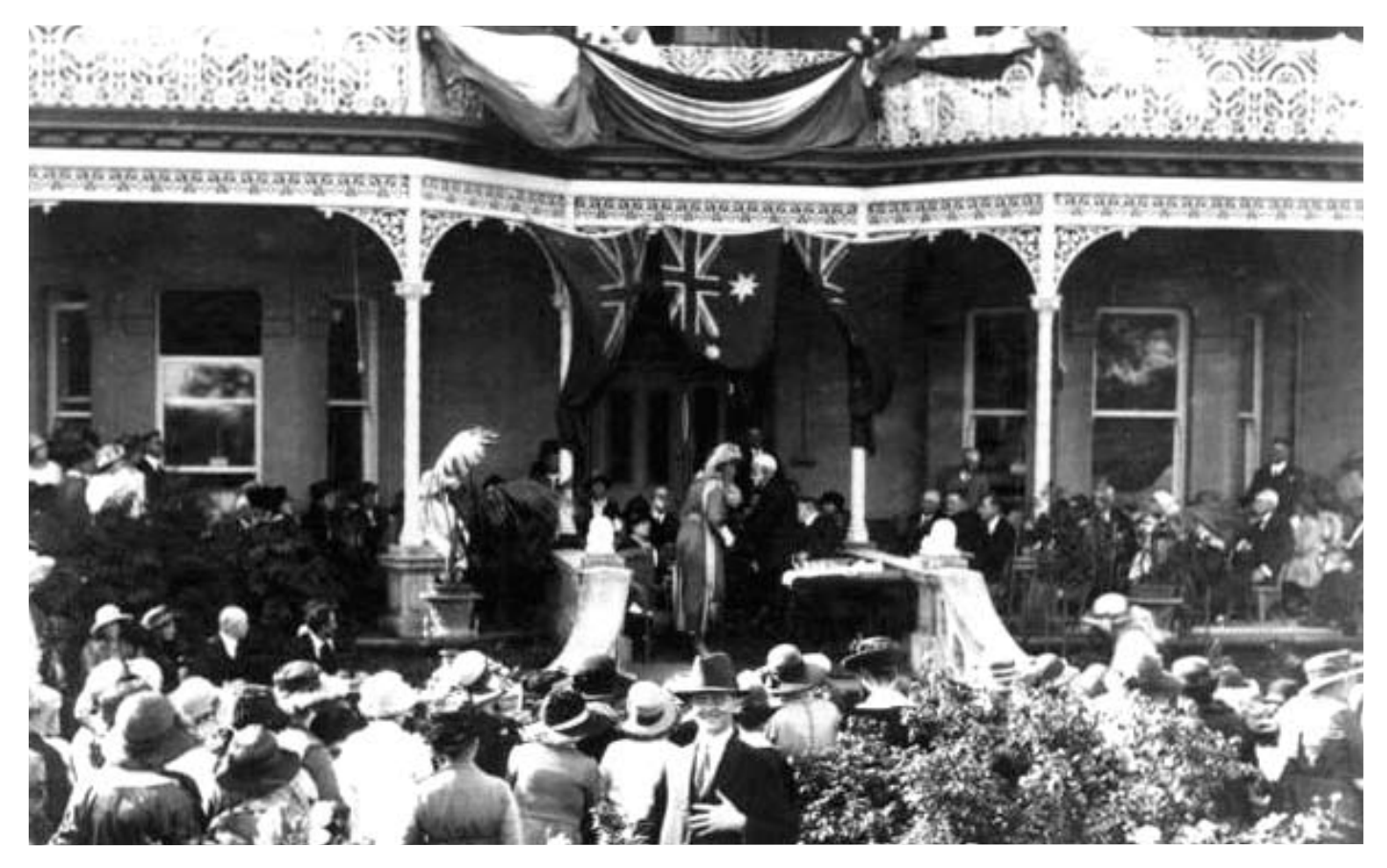
The official opening of Scarba Home, 26 September 1917

The infants were usually taken to the Society's Renwick Hospital for Infants for medical care, before being returned to Scarba.<sup>58</sup> While no reasons for the large number of these children being found in the early years are given in the records, it can be assumed that many were illegitimate births, a situation that carried great stigma at this time (and arguably until the 1970s). Others may have been born to women widowed in World War I, who found they were unable to care for a child on their own, especially in an era before child endowment or widows' pensions (introduced in NSW in 1926 and 1927 respectively).<sup>59</sup>