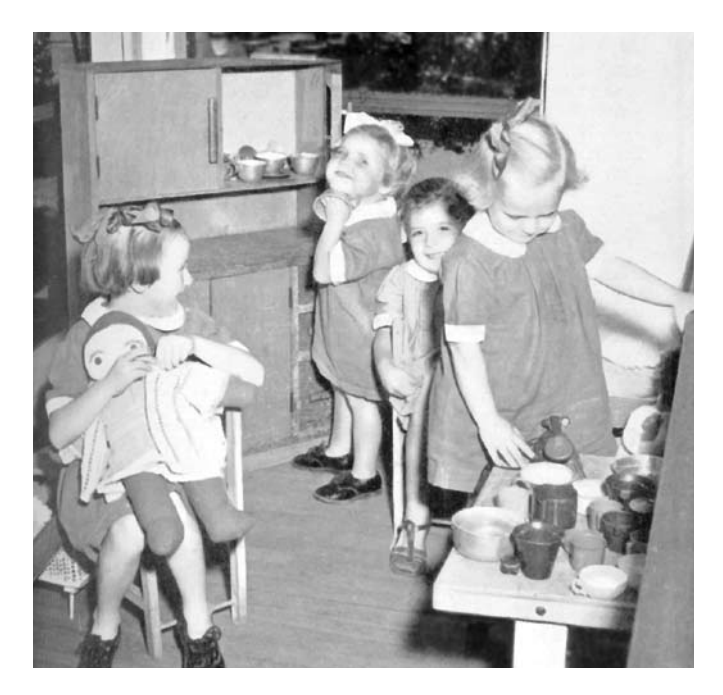
An afternoon tea party at Scarba Home, circa 1952

As Penglase notes, it is important to consider the attitudes of the time; it was assumed that if children received physical care and were socialised into mainstream values, they would lead happy and functional adult lives.<sup>54</sup>