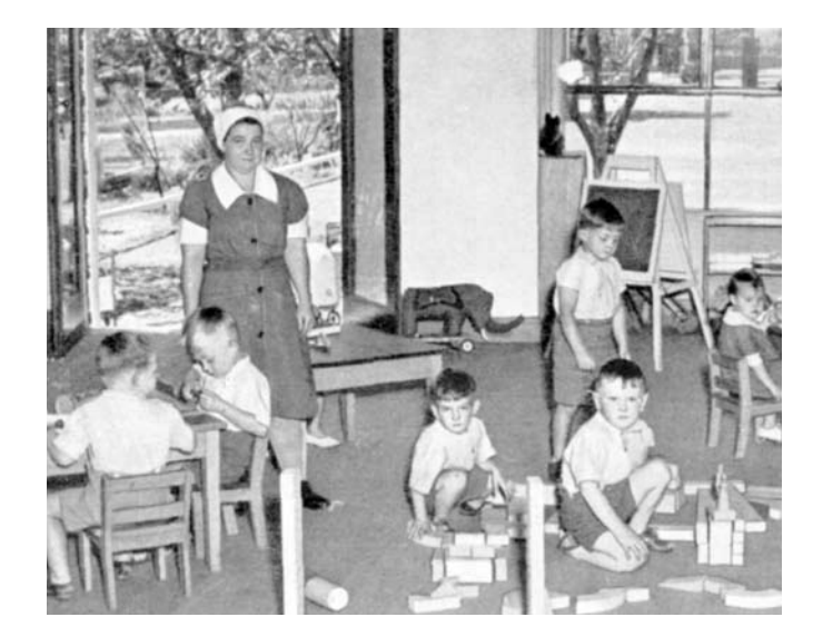
The kindergarten at Scarba, 1951

The past 40 years has seen a dramatic change in what is considered acceptable child welfare and childcare practice. From the 1950s, developments in psychology radically altered parental advice and drew attention to the