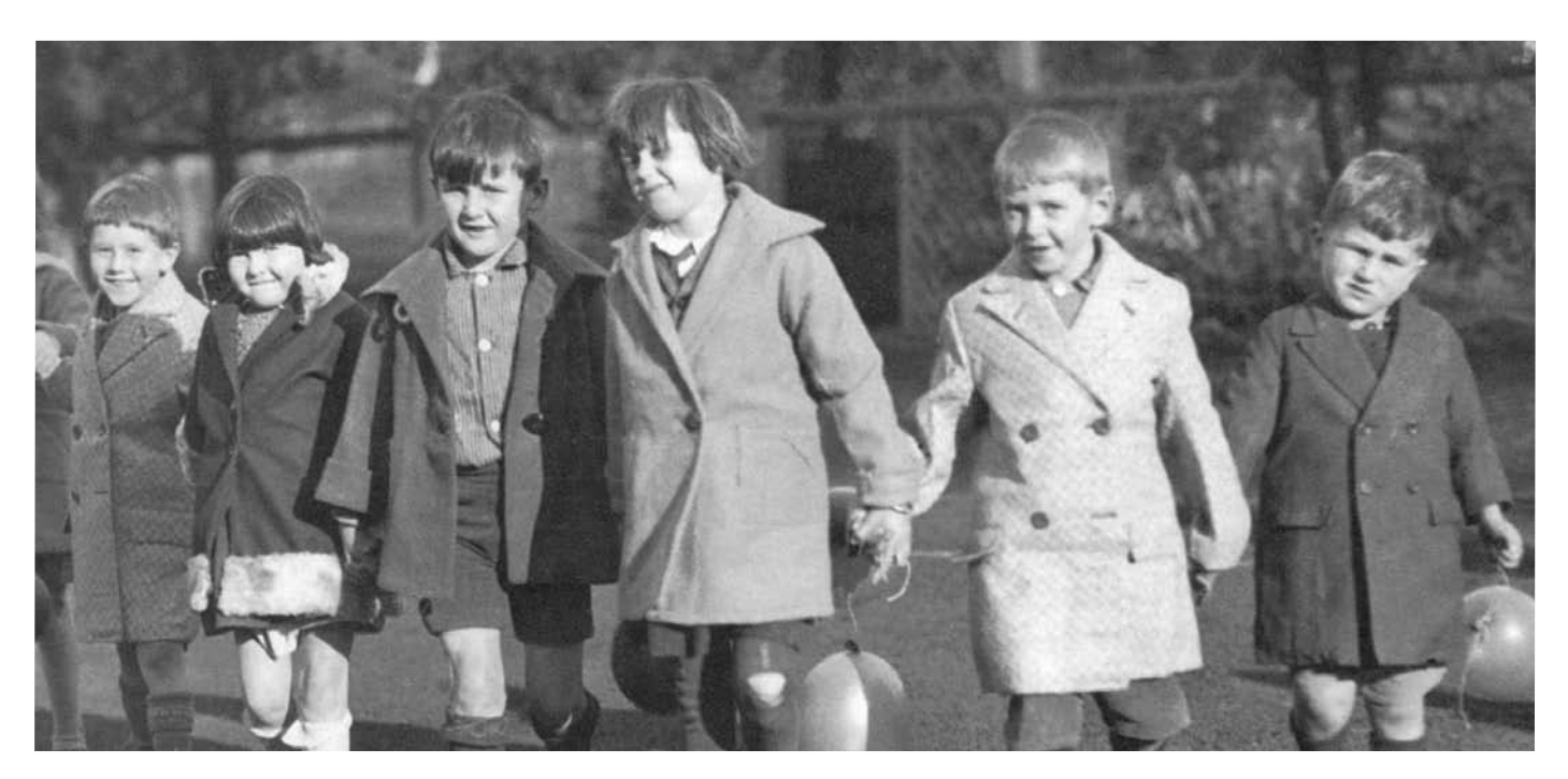
Children playing at Scarba, 1936