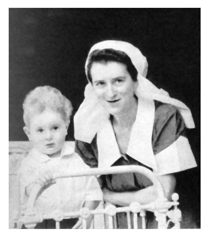
A child at Scarba Home, circa 1951