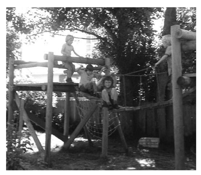
Children playing in the adventure playground at Scarba, 1975

The trauma children experience on being institutionalised was now recognised and family group care was seen as a way of minimising this.