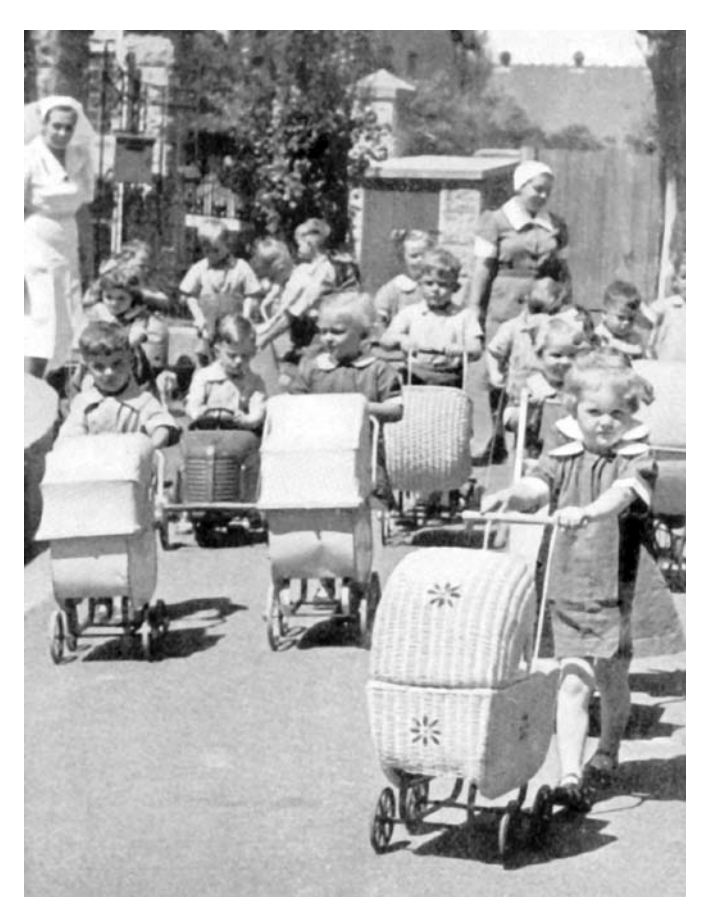
'Parade of the prams' at Scarba, circa 1951

early and mid 20<sup>th</sup> century. From our current viewpoint, care practices can seem harsh and difficult to understand, as can the sheer number of children who experienced out-of-home care. However, we must view this in the context of the attitudes and realities of the time, such as the lack of social security provisions and alternative services for families in crisis.