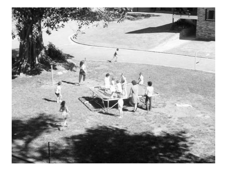
Children playing on a trampoline outside Scarba House

After-school care had now been running alongside the residential care at Scarba for