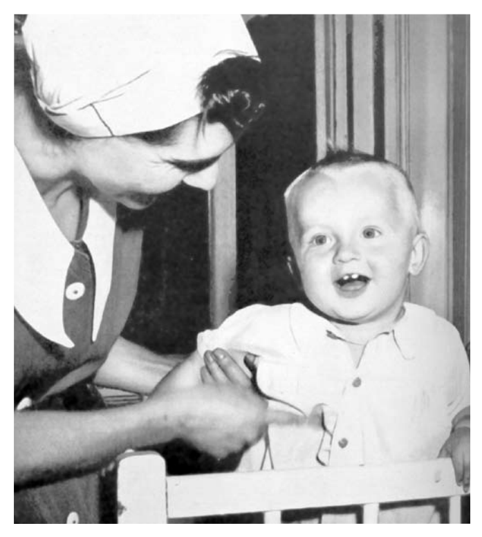
A child at Scarba, circa 1956

were generally not allowed to keep their own toys, "...because [of] the possibility of them being lost or destroyed by the large number of other children."<sup>97</sup> It was felt that the children's access to communal toys would alleviate their need for personal items. This highlights a lack of understanding of the emotional needs of children and a pragmatic view of care: the difficulties presented by the possibility of a lost toy were seen as outweighing the child's need for attachment and a sense of familiarity and safety.