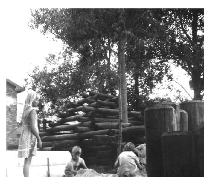
Children playing in the adventure playground at Scarba, 1975

The change to its funding status and the introduction of government subsidies for childcare providers for the care of children under five years allowed the introduction of day care to Scarba. The Society had already taken the view that institutional care for children was a last resort, and day care provided another