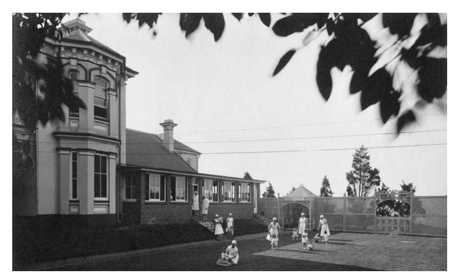
Children playing outside Scarba Home, 1928

Despite the late 19<sup>th</sup> century recognition of the value of the family, which was reflected in social policy, care practices in Australia have tended to replace the family with out-of-home care, rather than provide the support needed for a child to remain at home. In 20<sup>th</sup> century NSW, the majority of State wards were removed into foster care rather than institutions, however hundreds of institutions both government and non-government existed. The non-government institutions housed children placed by their parents in times of crisis and hardship; the government institutions housed State wards.