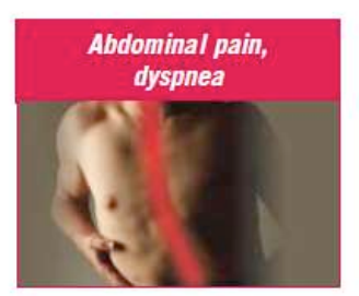
Disabling abdominal pain, fatigue, and other quality-oflife issues are commonly reported in PNH.<sup>5</sup>