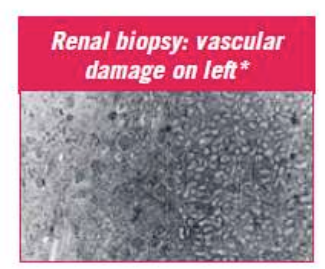
Chronic renal insufficiency (CRI) and acute renal failure (ARF) are leading causes of death in PNH. 1.3