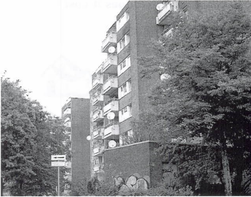
Figure 2: What is no longer allowed

Taking all the present and future FTA (free to air) and Pay (cable and satellite) television channels off the data channel equates to a saving of up to 7 or 8 Gbps (gigabits per second), a massive amount of bandwidth, which will pay huge benefits as the overall demand for bandwidth inevitably increases.