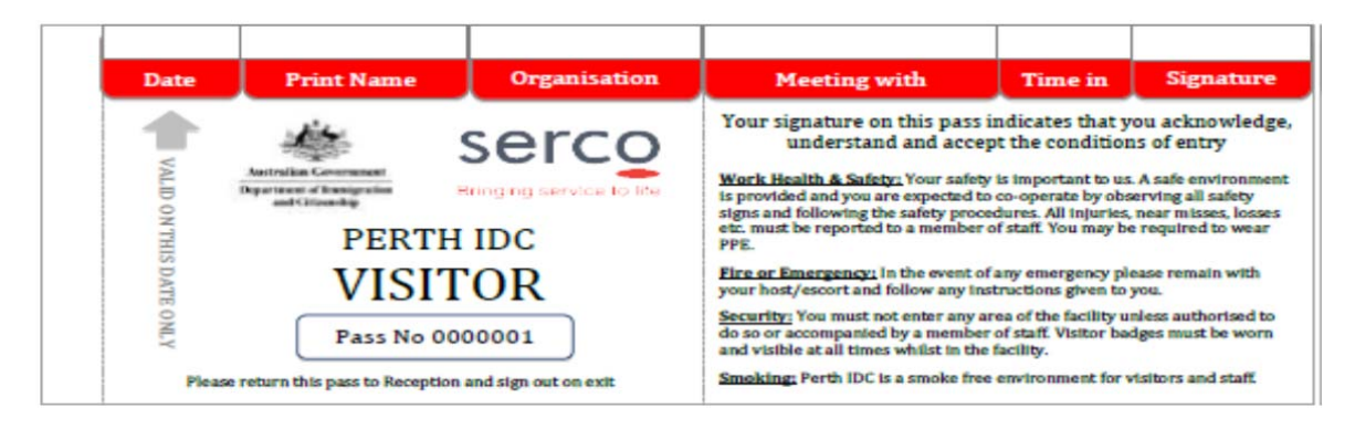
Figure 1. Front