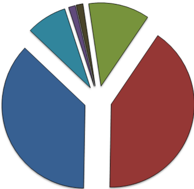
Composition of the Senate (43rd Parliament)