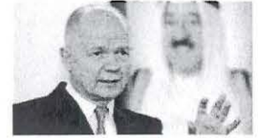
British, Kuwaiti FMs hold joint press conference