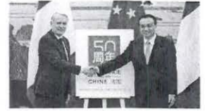
Chinese Premier, French PM unveil logo for 50th anniversary of diplomatic relations