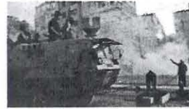
Tear gas fired at pro-Morsi protesters in Egypt