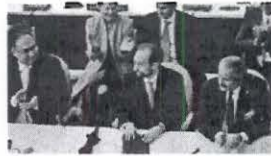
UN General Assembly elects Jordan to Security Council seat