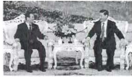
Chinese President meets ROK assembly speaker