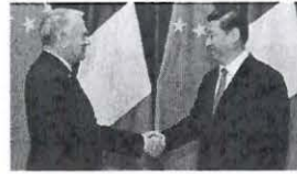
Chinese President meets French PM in Beijing