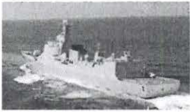
China's missile destroyer "Haikou"