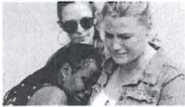
People mourn death of Nelson Mandela in South Africa