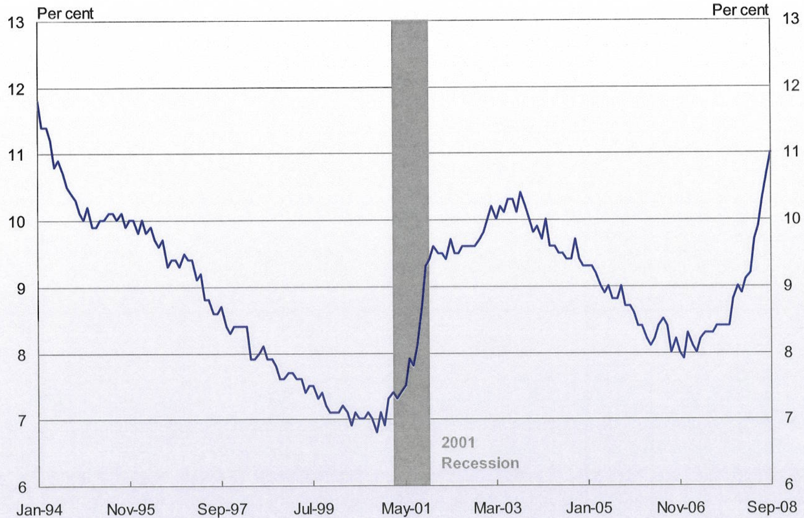
Chart 2: US Underemployment