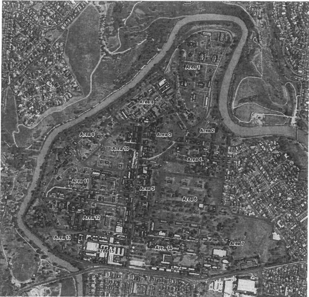
Figure C: Plan of Investigation Areas

Audit Area 1 comprises parts of Investigation Area 6 (Remount Depot, Stables and Explosive Storage) and Investigation Area 7 (Engineering Design Establishment (EDE)). It included four general areas: