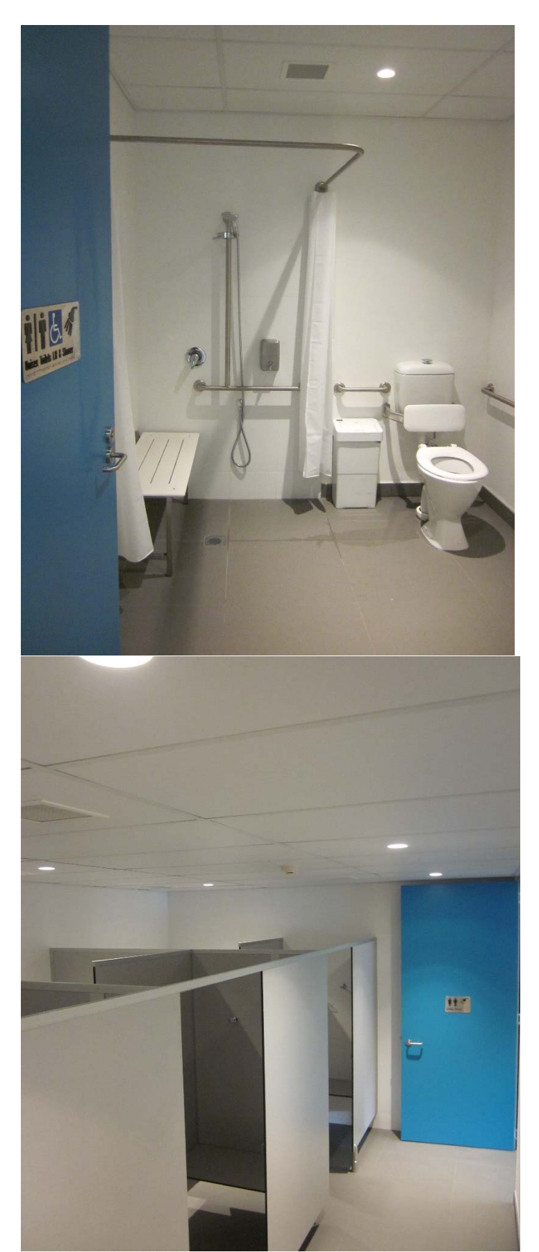
Level 3 accessible bathroom and 4 staff showers