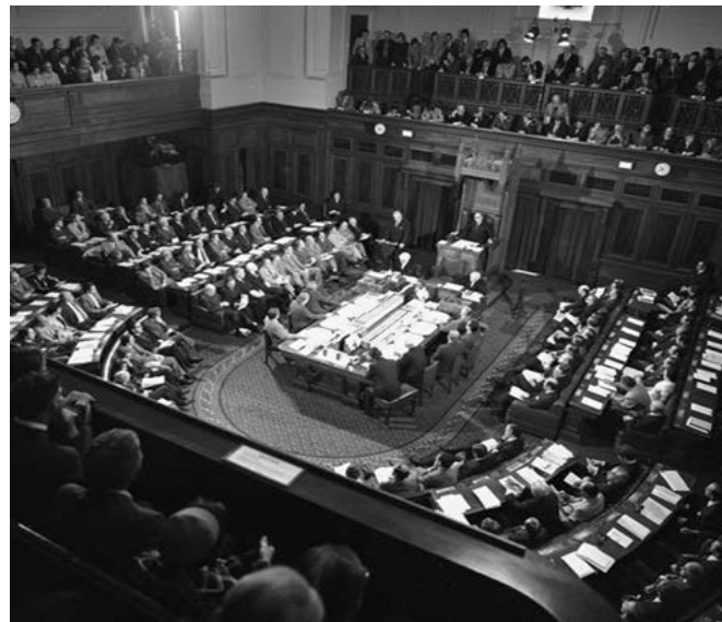
Joint sitting 1974

When the House expires, or is dissolved in normal circumstances, the Senate continues to exist as Senators remain in office until the completion of their term and only half stand for election at any one time. The Senate can only be dissolved in accordance with the double dissolution provisions of the Constitution, described below.