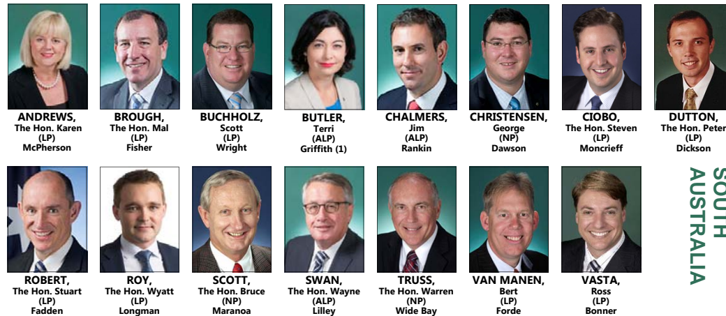
ANDREWS , The Hon. Karen (LP) McPherson BROUGH , The Hon. Mal (LP) Fisher BUCHHOLZ , Scott (LP) Wright BUTLER , Terri (ALP) Griffith (1) CHALMERS , Jim (ALP) Rankin CHRISTENSEN , George (NP) Dawson CIOBO , The Hon. Steven (LP) Moncrieff DUTTON , The Hon. Peter (LP) Dickson ENTSCHE , The Hon. Warren (LP) Leichhardt GAMBARO , The Hon. Teresa (ALP) Brisbane HOWARTH , Luke (LP) Petrie JONES , Ewen (LP) Herbert KATTER , The Hon. Bob (KAP) Kennedy LAMING , Andrew (LP) Bowman LANDRY , Michelle (NP) Capricornia SUKKAR , Michael (LP) Deakin TEHAN , The Hon. Dan (LP) Wannon THOMSON , The Hon. Kelvin (ALP) Wills TUDGE , The Hon. Alan (LP) Aston VAMVAKINOU , Maria (ALP) Calwell WATTS , Tim (ALP) Gellibrand WOOD , Jason (LP) La Trobe