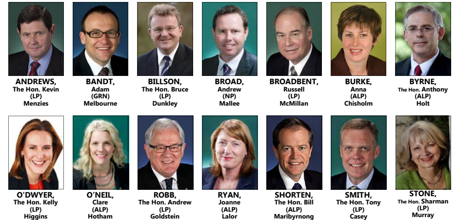
ANDREWS , The Hon. Kevin (LP) Menzies BANDT , Adam (GRN) Melbourne BILLSON , The Hon. Bruce (LP) Dunkley BROAD , Andrew (NP) Mallee BROADBENT , Russell (LP) McMillan BURKE , Anna (ALP) Chisholm BYRNE , The Hon. Anthony (ALP) Holt CHESTER , The Hon. Darren (NP) Gippsland CHESTERS , Lisa (ALP) Bendigo DANBY , The Hon. Michael (ALP) Melbourne Ports DREYFUS , The Hon. Mark (ALP) Isaacs FEENEY , The Hon. David (ALP) Batman FRYDENBERG , The Hon. Josh (ALP) Kooyong GILES , Andrew (ALP) Scullin GRIFFIN , The Hon. Alan (ALP) Bruce HENDERSON , Sarah (ALP) Corangamite HUNT , The Hon. Greg (ALP) Flinders KING , The Hon. Catherine (ALP) Ballarat MACKLIN , The Hon. Jenny (ALP) Jagajaga MARLES , The Hon. Richard (ALP) Corio McGOWAN , Cathy (IND) Indi MITCHELL , Rob (ALP) McEwen O'CONNOR , The Hon. Brendan (ALP) Gorton O'DWYER , The Hon. Kelly (ALP) Higgins O'NEIL , Clare (ALP) Hotham ROBB , The Hon. Andrew (ALP) Goldstein RYAN , Joanne (ALP) Lalor SHORTEN , The Hon. Bill (ALP) Maribyrnong SMITH , The Hon. Tony (LP) Casey STONE , The Hon. Sharnan (ALP) Murray