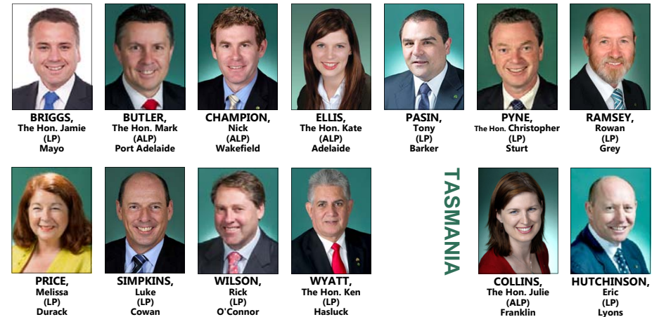
BRIGGS , The Hon. Jamie (LP) Mayo BUTLER , The Hon. Mark (ALP) Port Adelaide CHAMPION , Nick (ALP) Wakefield ELLIS , The Hon. Kate (ALP) Adelaide PASIN , Tony (LP) Barker PYNE , The Hon. Christopher (LP) Sturt RAMSEY , Rowan (LP) Grey MACFARLANE , The Hon. Ian (LP) Groom NEUMANN , The Hon. Shayne (ALP) Blair O'DOWD , Ken (NP) Flynn PALMER , Clive, (PUP) Fairfax PERRETT , Graham (ALP) Moreton PITT , The Hon. Keith (NP) Hinkler PRENTICE , The Hon. Jane (LP) Ryan RIPOLL , The Hon. Bernie (NP) Oxley ROBERT , The Hon. Stuart (LP) Fadden ROY , The Hon. Wyatt (LP) Longman SCOTT , The Hon. Bruce (LP) Maranoa SWAN , The Hon. Wayne (LP) Lillie TRUSS , The Hon. Warren (NP) Wide Bay VAN MANEN , Bert (LP) Forde VASTA , Ross (LP) Bonner BRIGGS , The Hon. Jamie (LP) Mayo BUTLER , The Hon. Mark (ALP) Port Adelaide CHAMPION , Nick (ALP) Wakefield ELLIS , The Hon. Kate (ALP) Adelaide PASIN , Tony (LP) Barker PYNE , The Hon. Christopher (LP) Sturt RAMSEY , Rowan (LP) Grey