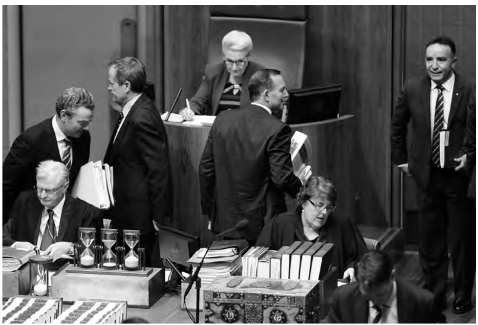
The Speaker presiding over a division in the House of Representatives.

Queries of the bills and legislation collection on the website totalled 23.6 million during the year, an increase of 8.8 per cent from the previous year (21.7 million in 2013–14). This total represented 22.0 per cent of the queries made through ParlInfo Search. Work to include bills from earlier parliaments back to 1998 in the electronic storage system was completed during the reporting period.