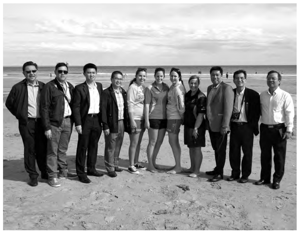
A delegation from ASEAN countries with members of the Inverloch Surf Lifesaving Club, November 2014.

In 2014–15, the budget allocation for the component was $2.493 million and expenditure was $2.233 million. Progress against the deliverable and key performance indicators for the component is summarised in Appendix 1. Staff levels, by location, are shown in Appendix 2.