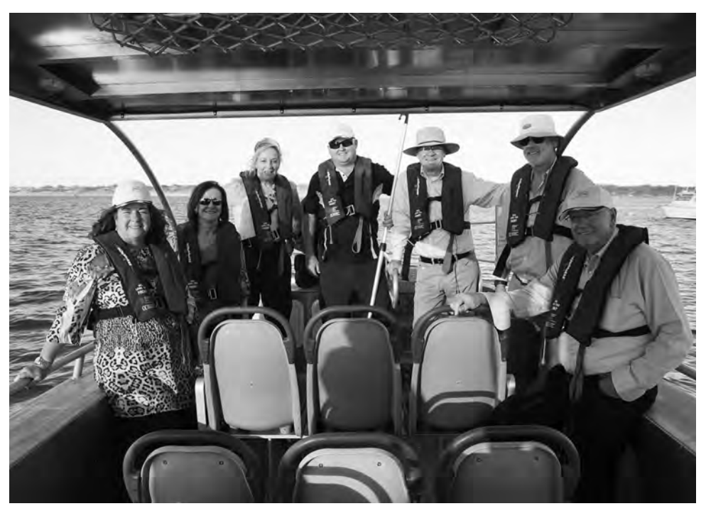
Members of the Joint Select Committee on Northern Australia during a visit to a Broome pearl farm as part of the inquiry into opportunities to expand the aquaculture industry in Northern Australia.

A key indicator for the Committee Office is the level of satisfaction with committee advice and services reported by members in the annual survey. In 2014–15, 100 per cent of members stated that they were extremely satisfied, highly satisfied or satisfied with the provision of procedural advice, research, analytical, report drafting and administrative support. The level of member satisfaction has been consistently high over the years. (See Appendix 3 for more detail on the survey results.)