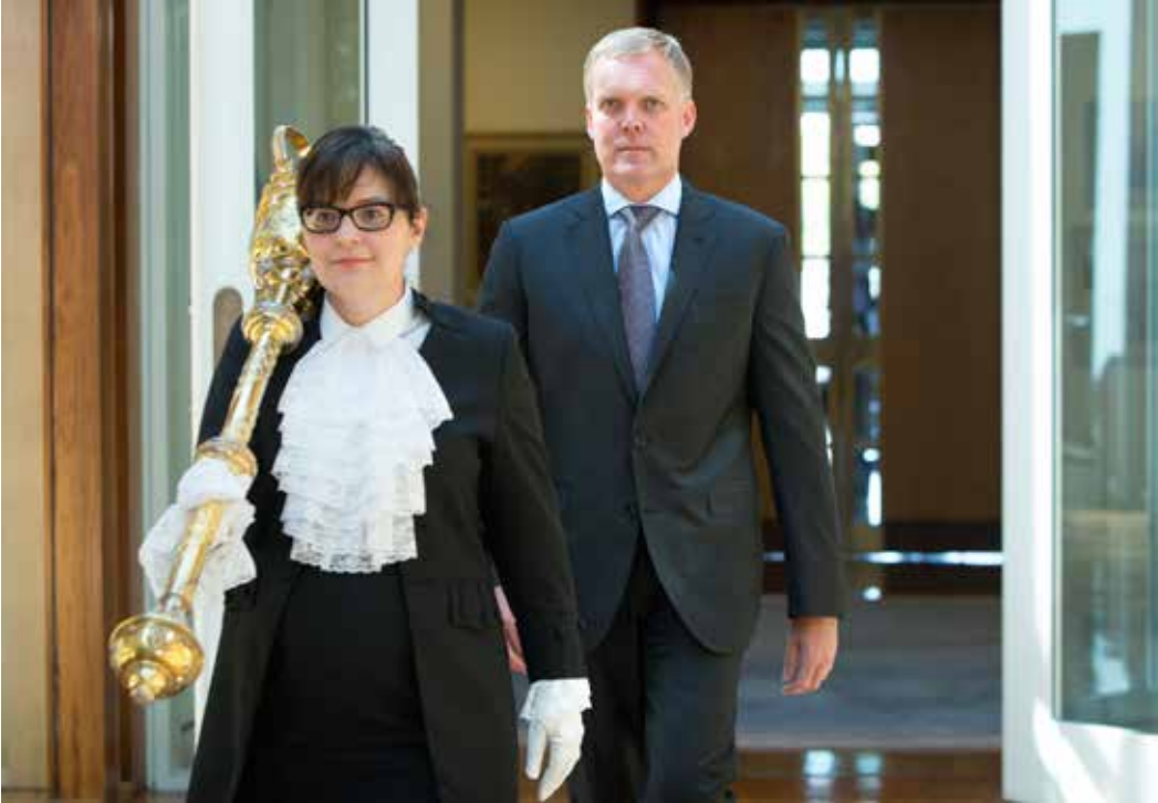
Ceremonial procession.

Official communications from and to the House are signed by and addressed to the Speaker. The Speaker receives delegations from other Parliaments and other visitors on behalf of the House. When important official guests such as Heads of State or Government from other countries address the House, the Speaker announces and introduces them. On formal occasions involving the House the Speaker plays a central ceremonial role.