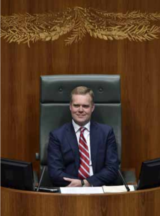
Speaker Smith in the Chair.

The Speaker must maintain order during debate. While most proceedings are routine and without incident there are occasions when passions become inflamed, excessive interjections occur and the House becomes noisy and unruly. The standing orders provide disciplinary powers to enable the Speaker to maintain order. These vary in their severity and allow the Speaker to deal with breaches of order in the most appropriate manner. For a minor infringement a Member may merely be called to order or warned. For a more serious or repeated offence, a Member may be ordered to withdraw from the Chamber for one hour (sometimes unofficially referred to as being “sin binned”) and, for a major offence or persistent defiance of the Chair, a Member may be “named” by the Chair and a motion for the Member’s suspension (usually for 24 hours) moved.