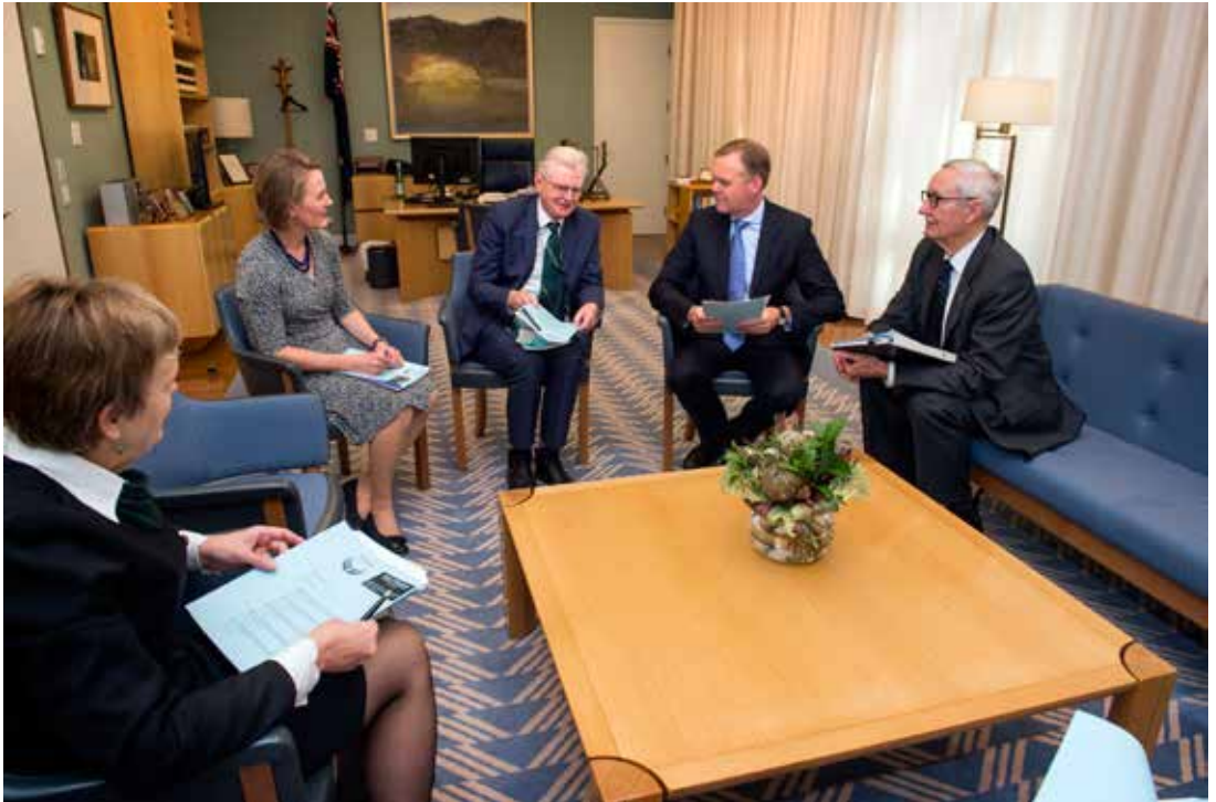
The Speaker meeting with the Clerks and Deputy Speaker.

The Department of the House of Representatives provides the administrative machinery for the efficient operation of the House of Representatives and its committees and a range of services and facilities for Members in Parliament House. These include office accommodation, printing and other support in Parliament House and the responsibility for the payment of Members' parliamentary salaries and allowances.