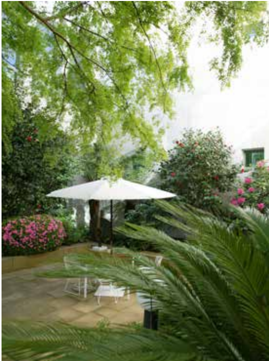
The Speaker's courtyard.