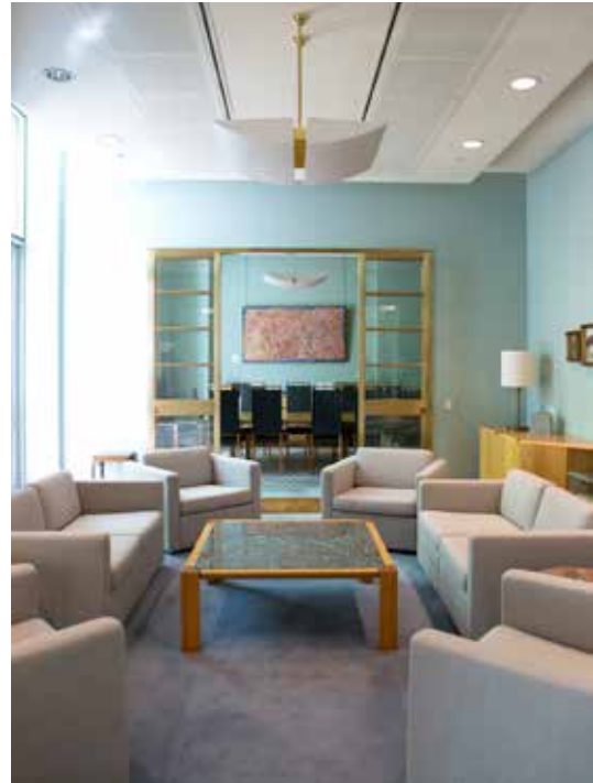
Ambassador's lounge in Speaker's suite.