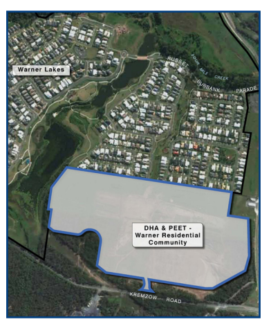
Photograph of the proposed development site.

The primary role of DHA is to support Defence members and their families by providing quality housing.