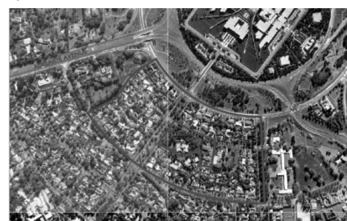
Figure 1 Overview of Deakin/Forrest residential area