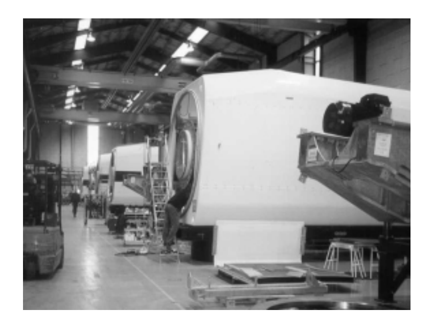
Vestas Assembly Plant, Ringkobing Denmark

Analysis of American Industry movement shows that there has been very little transplantation of factories from America to countries like Venezuela and Saudi Arabia that have cheaper energy. In most cases it is not cheap energy which motivates companies to transplant factories, but rather the prospect of cheap labour or better tax rules (Lovins)<sup>9</sup>.