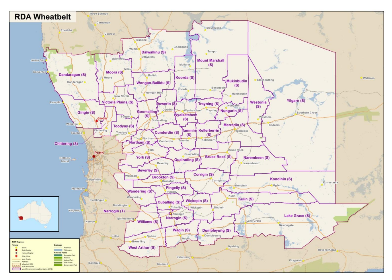
Figure 1. Wheatbelt Region Western Australia

In 2007 Engineers of Australia provided a comprehensive report card on each state and associated regions on both fixed communication infrastructure and mobile communications systems. In this report known as the "Telecommunications Infrastructure Report Card 2007" rankings were assigned for fixed and mobile infrastructure across the nation. The Wheatbelt region received a ranking of "Inadequate" which was defined as "minimal telecommunications infrastructure and the minimal expectations of the majority of users cannot be met." This assessment is consistent with our view that the region is in need of significant infrastructure upgrades to improve service and eliminate black spots, which are currently limiting social and economic growth in the region.