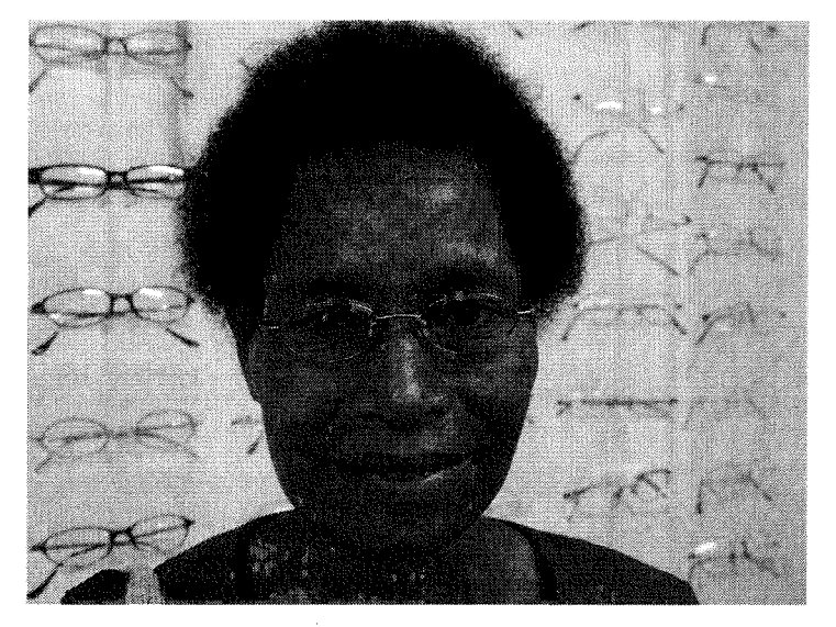
Restoring Sight at the Port Moresby Vision Centre