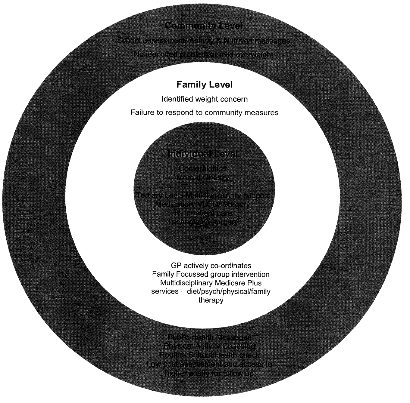
Figure 2. Targeting Australia's Health Problem