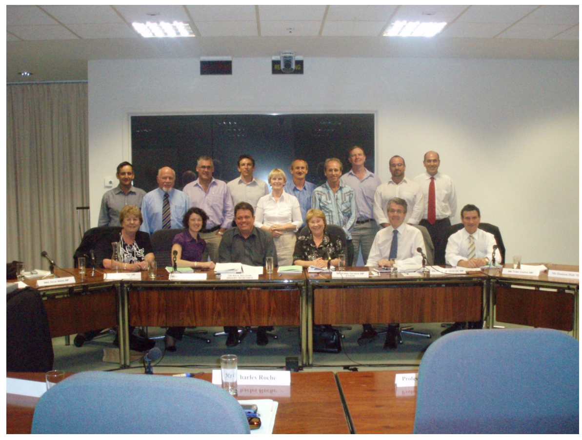
Committee members meet with Northern Territory coastal stakeholders, following a public hearing in Darwin in August 2008

recognises the concerns of states and the NT about the need for a cooperative national approach to reduce rather than increase the complexity of current coastal governance arrangements and for such an approach to take into account the diversity across Australia's vast coastal zone.