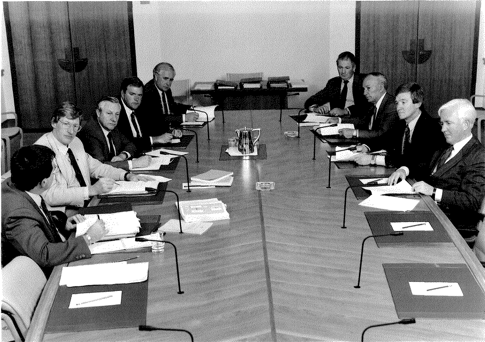
A meeting of the Procedure Committee, November 1988