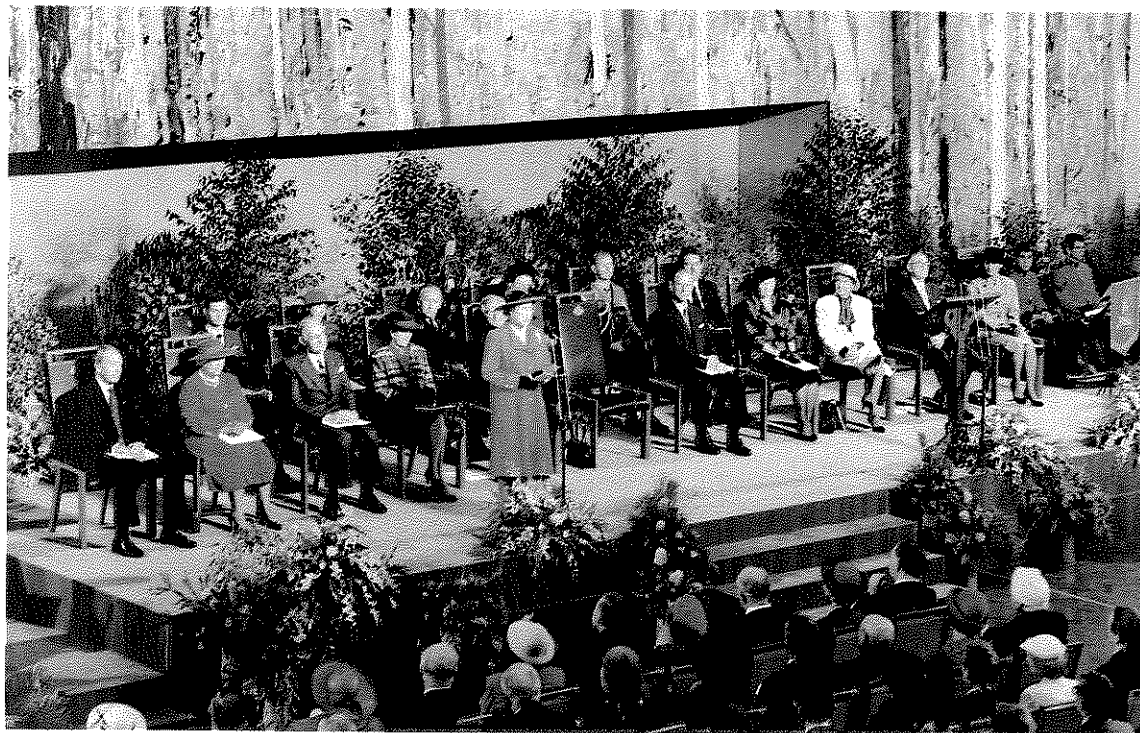
Opening of the new Parliament House by Her Majesty the Queen in the Great Hall on 9 May 1988