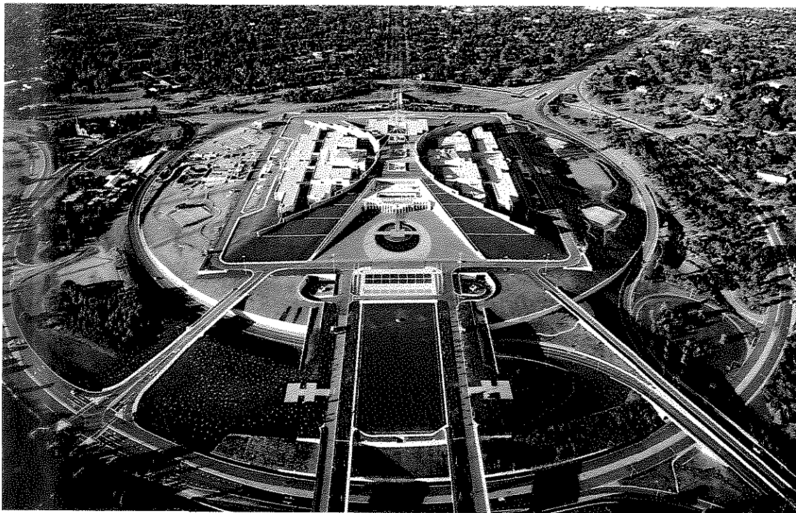
Aerial view of Parliament House, January 1989