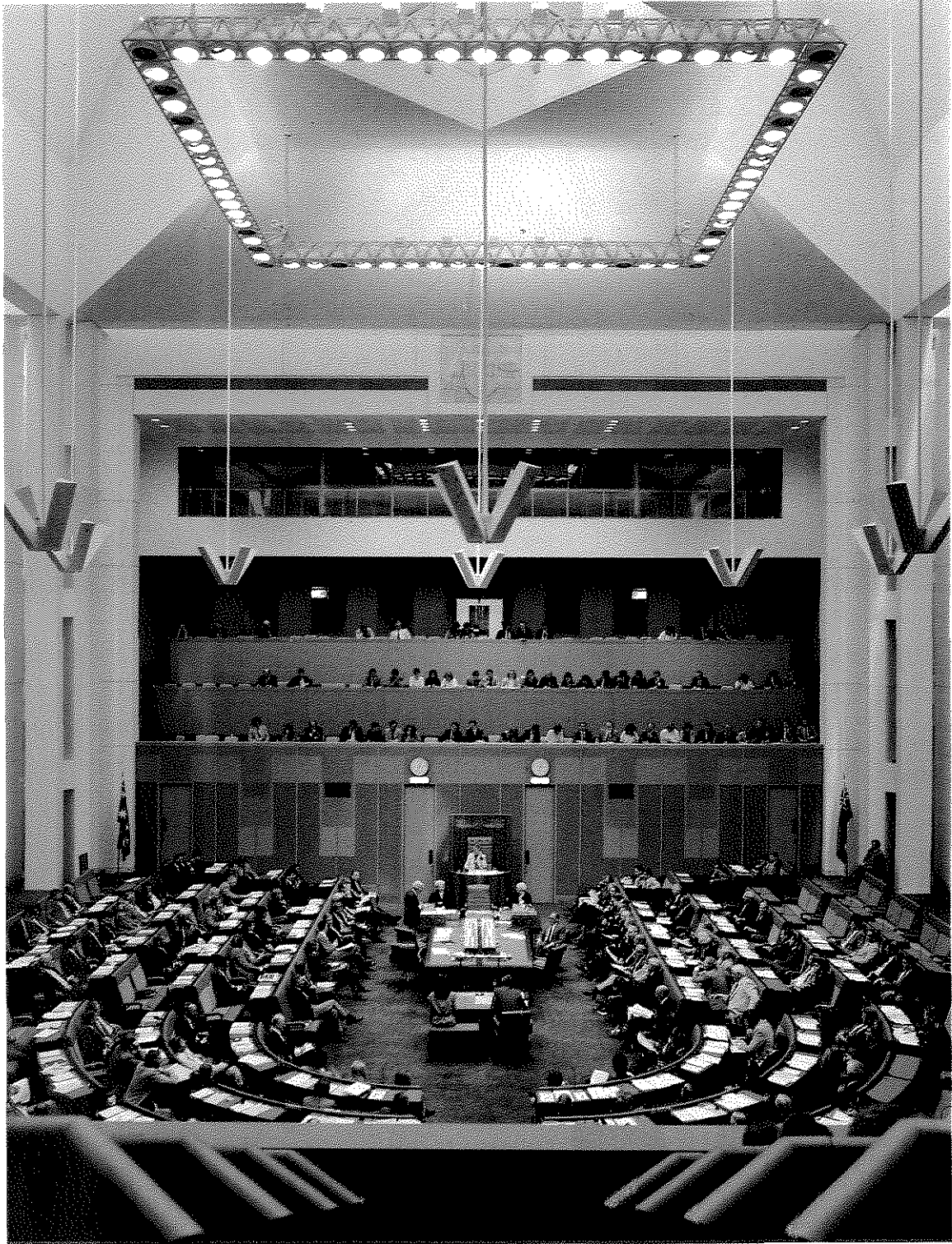
The Chamber of the House of Representatives