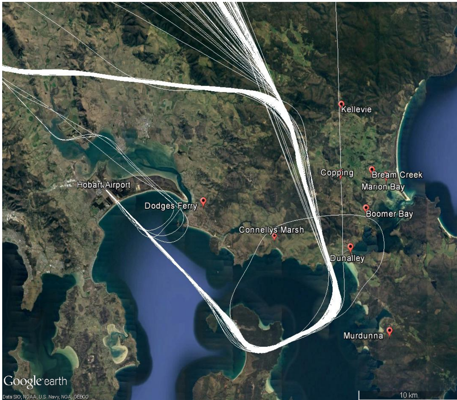
Revised Standard Terminal Arrival Routes (STARs)