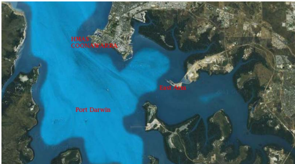
Figure 3: Darwin harbour, showing HMAS Coonawarra and East Arm wharf.