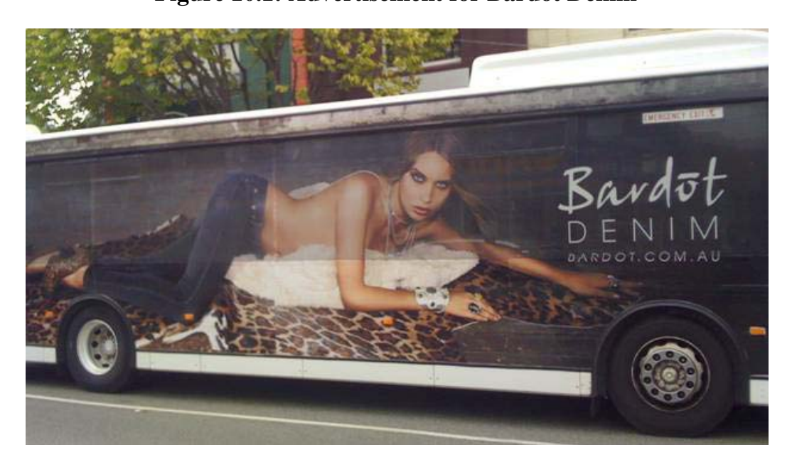
Figure 10.1: Advertisement for Bardot Denim

10.55 The advertisements were for 'Bardot Denim', for placement on buses, and an outdoor advertisement for 'Sprite':