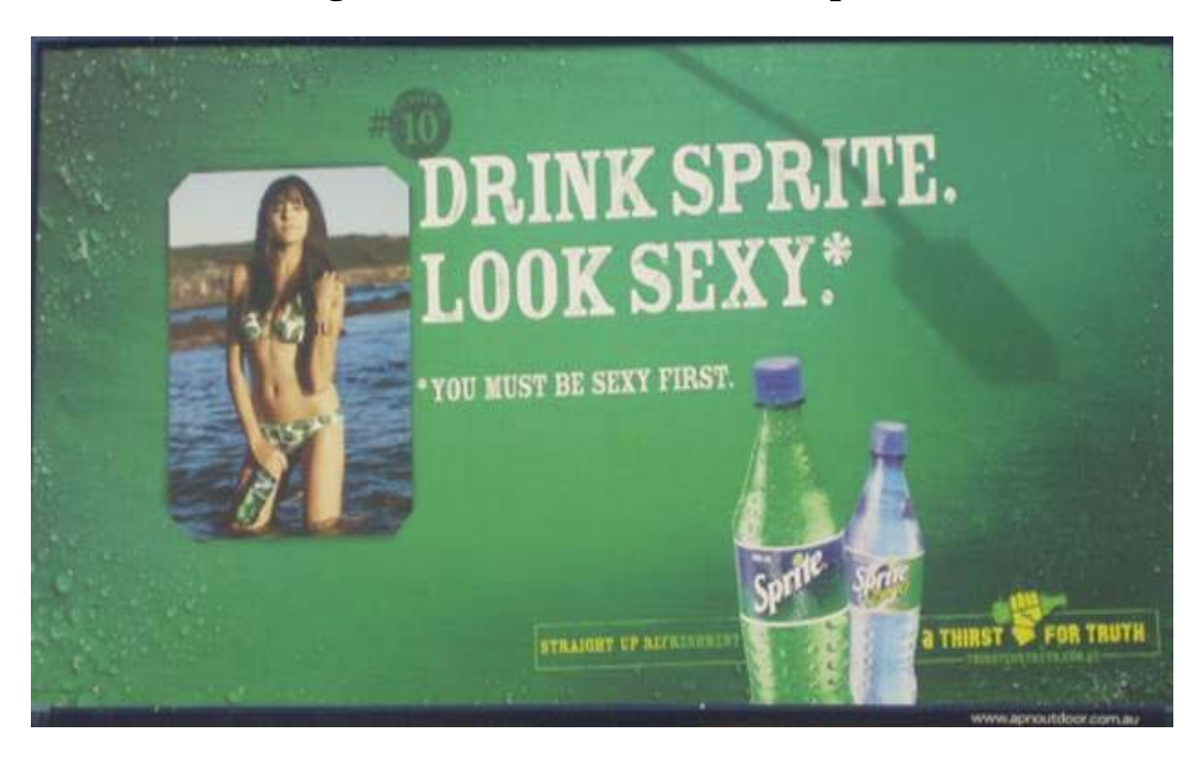
Figure 10.2: Advertisement for Sprite

10.56 Complaints in relation to both advertisements were made to the Advertising Standards Board. In both cases, the Advertising Standards Board considered whether the advertisement breached section 2.3 of the AANA Code of Ethics (treat sex, sexuality and nudity with sensitivity to the relevant audience and, where appropriate, the relevant programme time zone). For the Bardot Denim advertisement, the Advertisement Standards Board also considered section 2.1 of the AANA Code of Ethics (advertising shall not portray people or depict material in a way which discriminates against or vilifies a person or section of the community on account of race, ethnicity, nationality, sex, age, sexual preference, religion, disability or political belief). The complaints against both advertisements were dismissed.