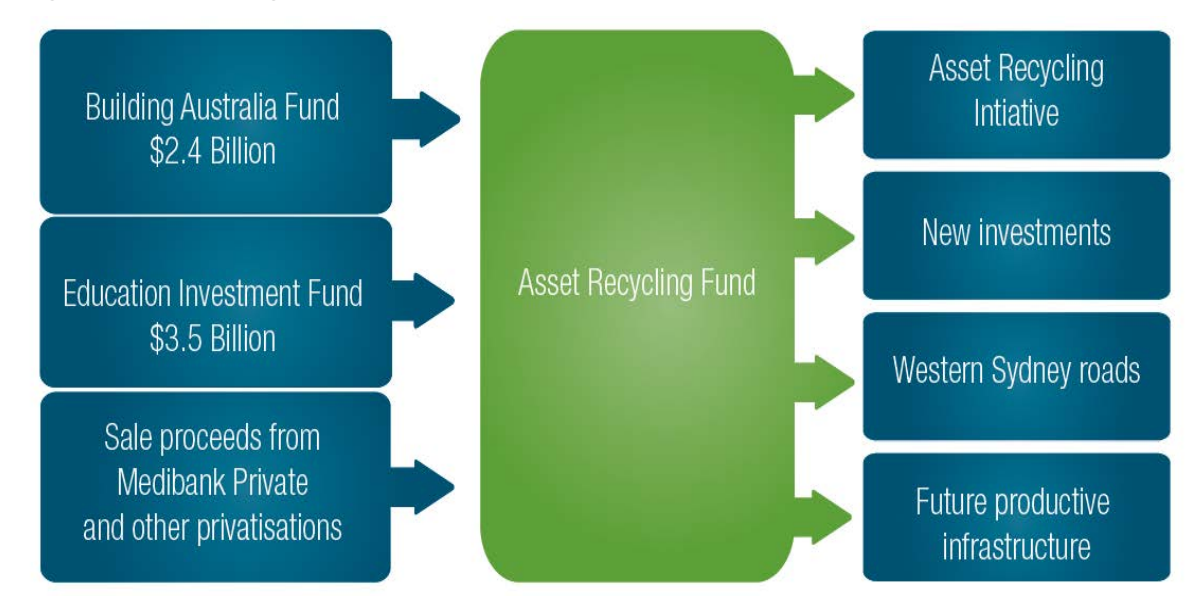
Figure 1: Funding new infrastructure in the states and territories

1.12 Expected investment is outlined in Figure 2 below.<sup>9</sup>