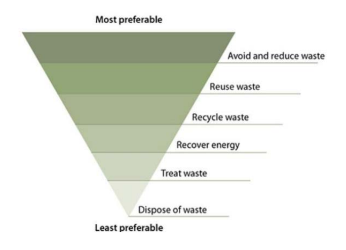
Source: Waste Management Association of Australia, Submission 52, p. 2.

2.6 Waste avoidance includes actions to reduce the amount of waste generated by households, industry and government. This strategy is intended to maximise efficiency and avoid unnecessary use of virgin materials through changes in consumer behaviour.<sup>4</sup>