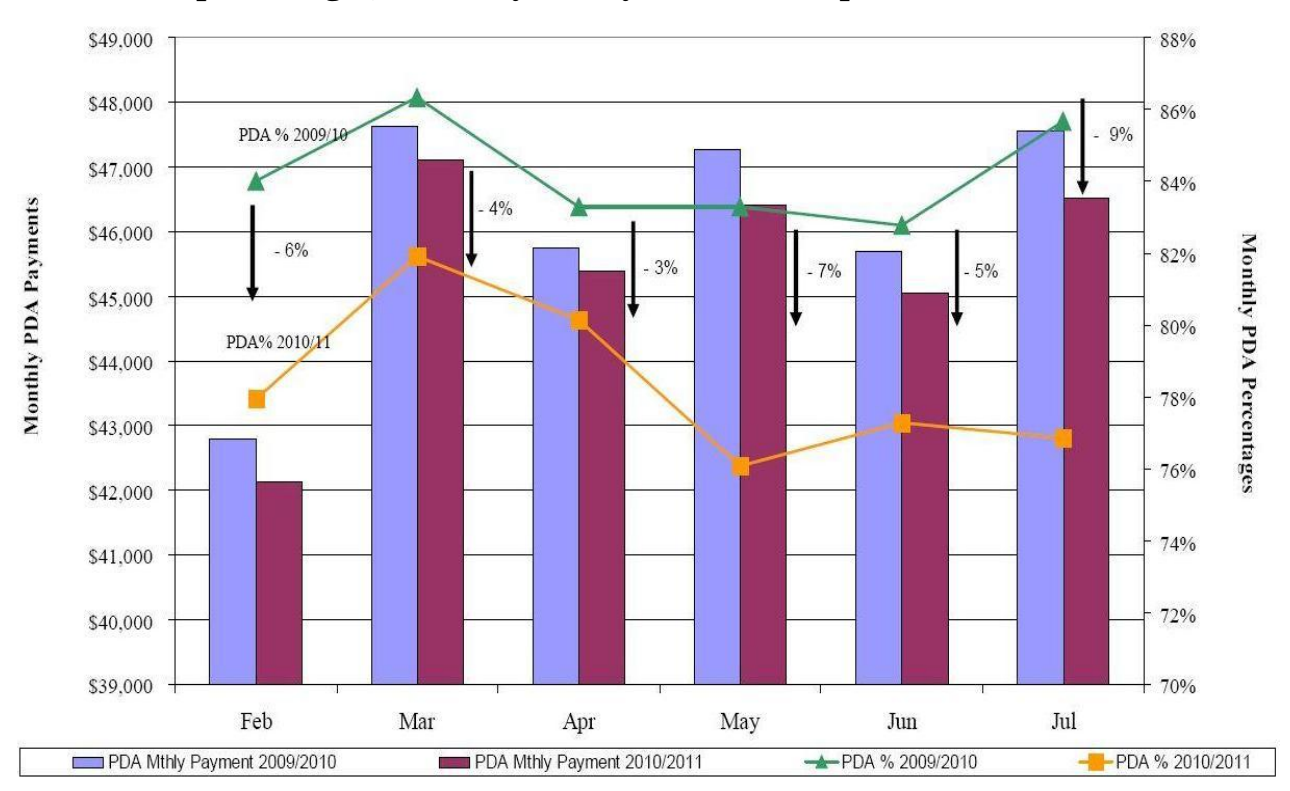
Figure 5.3: Pauls Daily Access one million litre dairy farm monthly returns and percentages, February to July 2009–10 compared to 2010–11

for has come down significantly. The bolstered-up figure is 80.89. That shows already a significant drop off, even since September. Particularly when you compare month on month with a year ago—because months do vary, normally—that is a significant fall, down from the base figure in southeast Queensland of 84.23 to 77.94. To a dairy farmer that is a significant drop in his income for that month.<sup>23</sup>