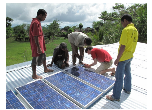
Above: Australian and Timorese volunteers installing the solar panel

The women's centre was completed in 2010 and is the first of its kind in rural Timor-Leste. With high powered solar panel, directional LED lighting and 500lt water tank, the building was completed by five self-funded Australian volunteers and a team of 18 local and international volunteers.