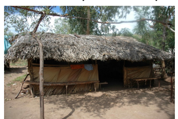
Above: typical housing for the poorest community members

Importantly, official statistics demonstrate the burden that poverty places on women and girls in the area. Only 19% of women are engaged in economic activity (compared to the national average of 31.3%). The difficulty of accessing the closest hospital seriously inhibits good health; for example, only 43 of 1,565 births (3%) occurred in a hospital in 2010. One in four women are illiterate, less than 3% of girls are enrolled in secondary school (compared to the national average of 17.9%), and half the female population has never attended school at any level. Of the 1,420 houses in Iliomar, 83% do not provide sufficient protection against the elements. 96% of families still cook with wood. Only 23% have sanitation and only 17% have electricity.