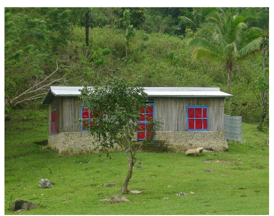
Above: The completed Women's Centre, Fuat Village, Iliomar