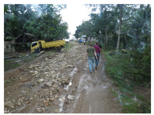
Above: the state of the roads in Iliomar.