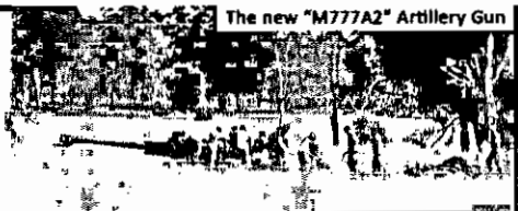
The new "M777A2" Artillery Gun