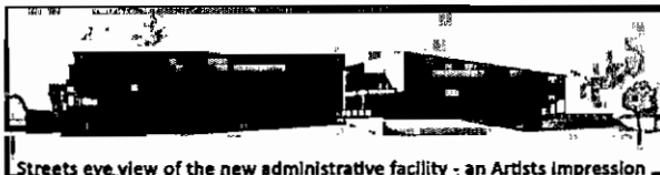
Streets eye view of the new administrative facility - an Artists Impression

Any increase in traffic in the local area is expected to be minimal in the long term as the actual number of guns held by 1 Regt will be reduced. In the short term, construction traffic will be managed with routes established so that any disruption to local neighbourhoods will be minimised. Construction working hours will be limited to Brisbane City Council approved hours (6am to 6pm, Monday to Saturday). The construction site is located well within the Gallipoli Barracks boundaries so construction activities will not cause any disruption (for example noise or dust) to local residents.