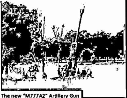
The new "M777A2" Artillery Gun

Under the LAND 17 Phase 1A Project, the Department of Defence is introducing a new artillery gun (the "M777A2") to help ensure Australia retains a modern military force to protect its national interests. Up to 12 of these new guns will be based at Gallipoli Barracks, Enoggera, with the 1st Regiment, Royal Australian Artillery (1 Regt). Whilst the new guns will be stored and maintained at Enoggera by 1 Regt, there will be no live firing training conducted at the Barracks.