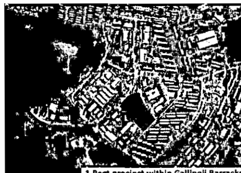
1 Regt precinct within Gallipoli Barracks

Independent heritage and environmental studies of the construction area have been commissioned by Defence with no issues raised. The site is a developed area of Gallipoli Barracks so no clearing of bushland is required and the buildings to be demolished to make way for the new facilities have no heritage significance.