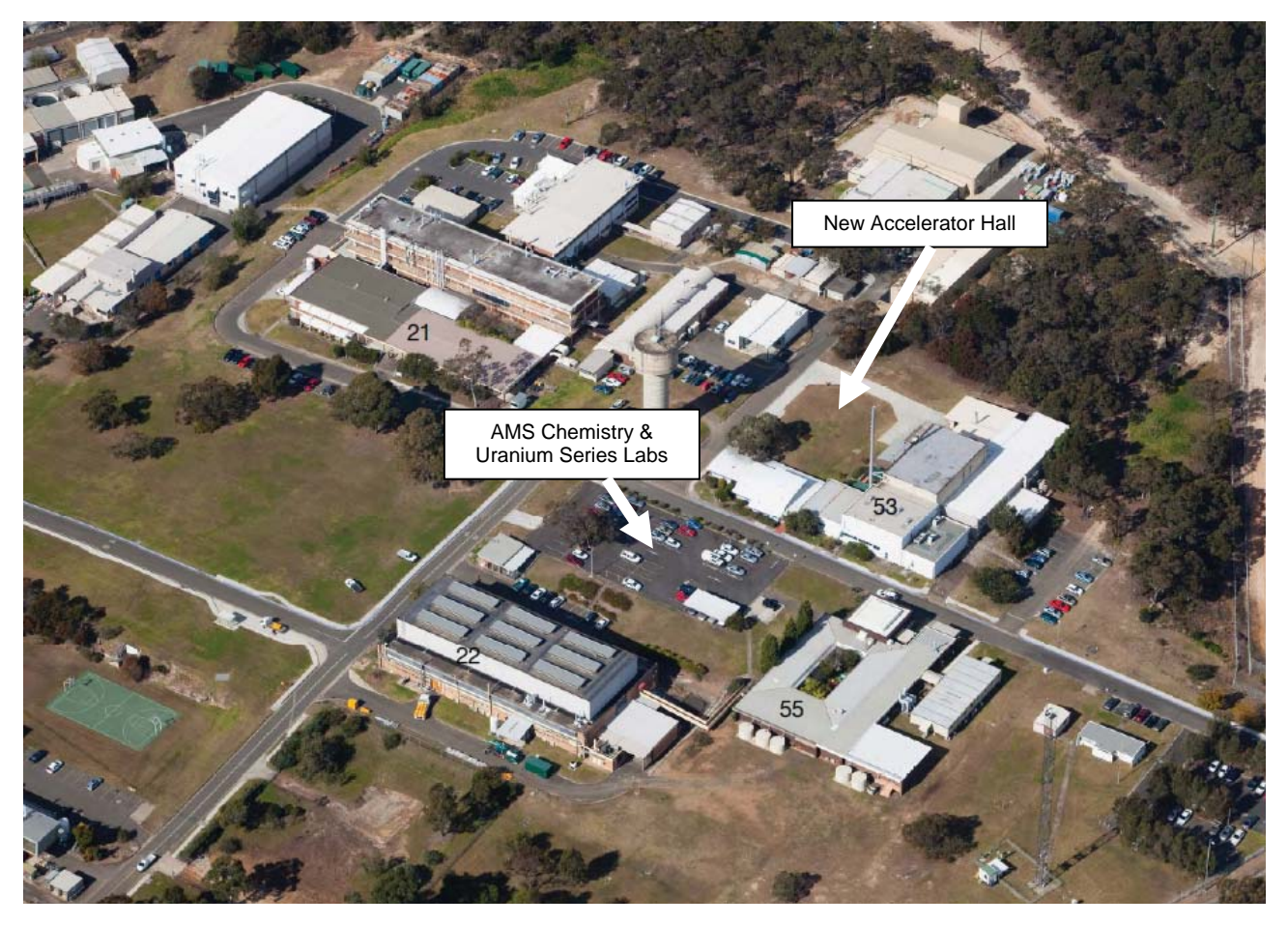
Figure 1 General location of proposed site, showing the existing ANTARES accelerator facility (Building 53), the STAR accelerator facility (Building 22) and the Institute of Environmental Research (Building 21).

2.2.4 The 'Accelerator Hall' is to be located behind the existing ANTARES accelerator building (Building 53) without the need for any demolition to existing facilities. Accelerator service laboratories will adjoin the accelerator hall to the south.