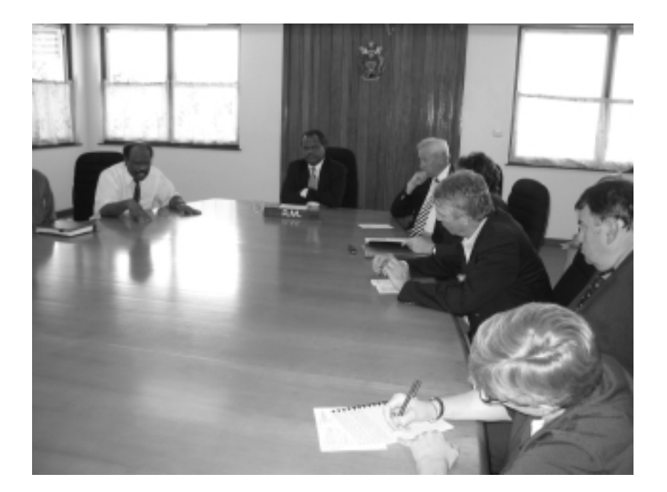
Figure 1.6 Meeting with the Prime Minister the Hon Sir Allan Kemakeza and senior Ministers