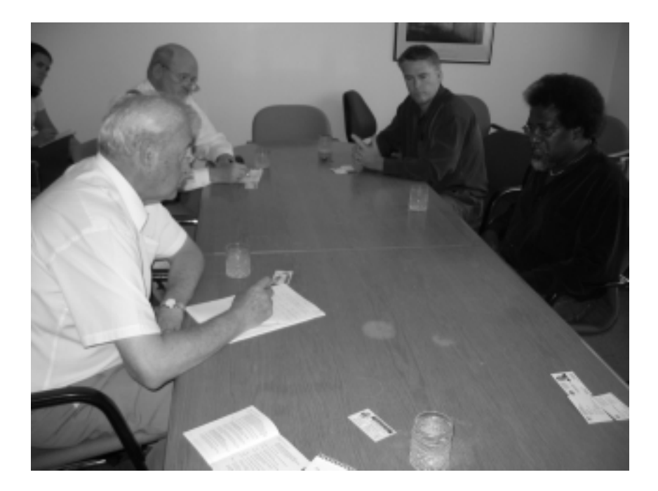
Figure 1.5 Meeting with Opposition Members of the Parliament of the Solomon Islands