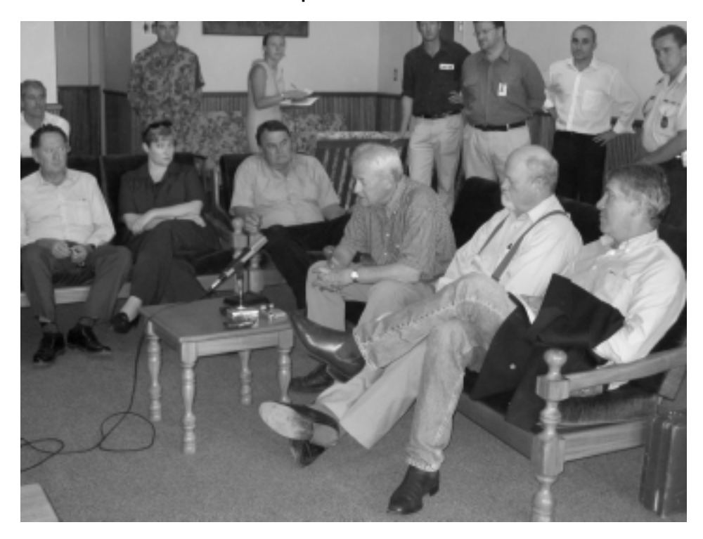
Figure 1.7 Press Conference at Honiara Airport