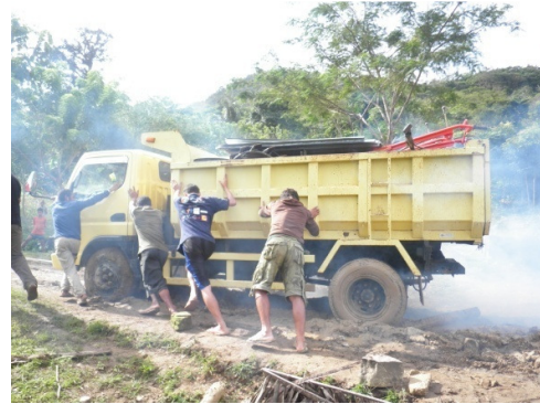
Above: One hour was needed to push this truck out of a serious bog.

The months between August and November – known as the “hungry months” due to food shortages – are hot and dry. Eight in ten families are engaged in subsistence farming activities and only 39% are engaged in economic activity, compared to the national average of 46.4%. Even this economic activity is not the same as paid employment, however.