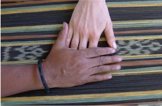
Above: Signature photo for our collaborative textiles range to be released in late 2013

researchers have gained unique learning experiences. These skills exchanges have built their professional and personal confidence. As these volunteers were immersed in the different cultural landscape of rural Timor-Leste, their experiences and understanding enrich the landscape of multicultural Australia. The next phase of our collaborative work will commence in April 2013.