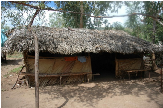
Above: typical housing for the poorest community members

Importantly, official statistics demonstrate the burden that poverty places on women and girls in the area. Only 19% of women are engaged in economic activity (compared to the national average of 31.3%). The difficulty of accessing the closest hospital seriously inhibits good health; for example, only 43 of 1,565 births (3%) occurred in a hospital in 2010. One in four women are illiterate, less than 3% of girls are enrolled in secondary school (compared to the national average of 17.9%), and half the female population has never attended school at any level. Of the 1,420 houses in Iliomar, 83% do not provide sufficient protection against the elements. 96% of families still cook with wood. Only 23% have sanitation and only 17% have electricity.