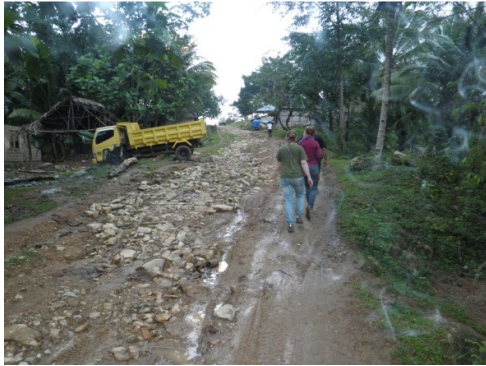
Above: the state of the roads in Iliomar.