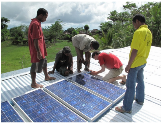
Above: Australian and Timorese volunteers installing the solar panel

The women's centre was completed in 2010 and is the first of its kind in rural Timor-Leste. With high powered solar panel, directional LED lighting and 500lt water tank, the building was completed by five self-funded Australian volunteers and a team of 18 local and international volunteers.