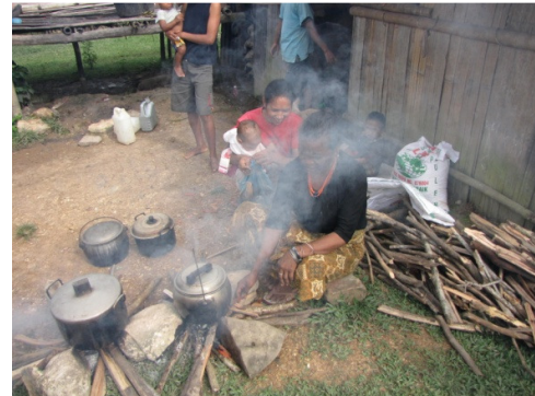
Above: typical cooking and kitchen facilities

In summary, the last decade of economic growth and Dili-centric development has not improved the quality of life for women and girls in Iliomar. They lack basic infrastructure and services, and access to development opportunities is prohibited by their isolation, illiteracy and formal education. Malnutrition, mortality and the burden of disease are also high in comparison with the national average.