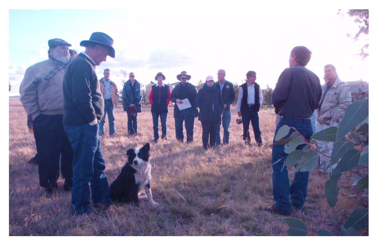
Members of the Committee, with representatives of Southern New England Landcare, inspecting an example of engineered woodland in the Tamworth region.