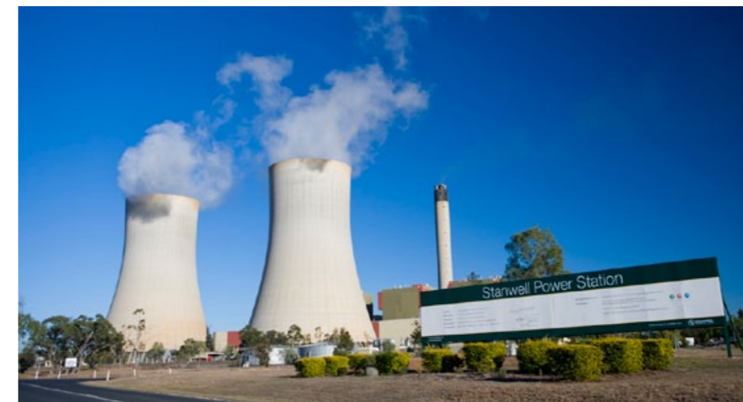
CAPRICORN COAST & ROCKHAMPTON REGION