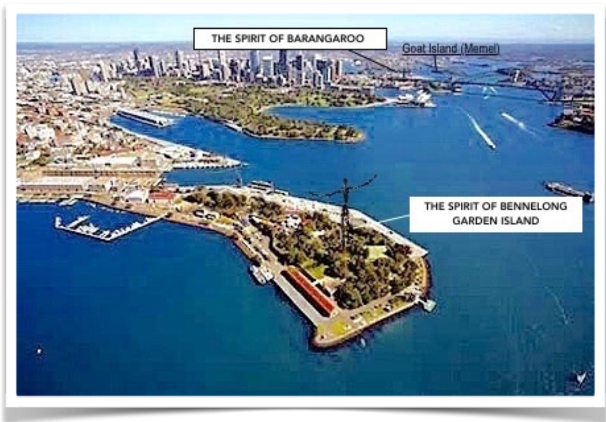
PIC: 'Australia for Everyone' with additions by 'the caretaker'