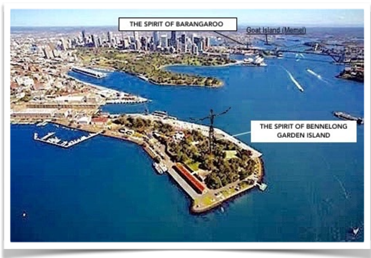
PIC: 'Australia for Everyone' with additions by 'the caretaker'