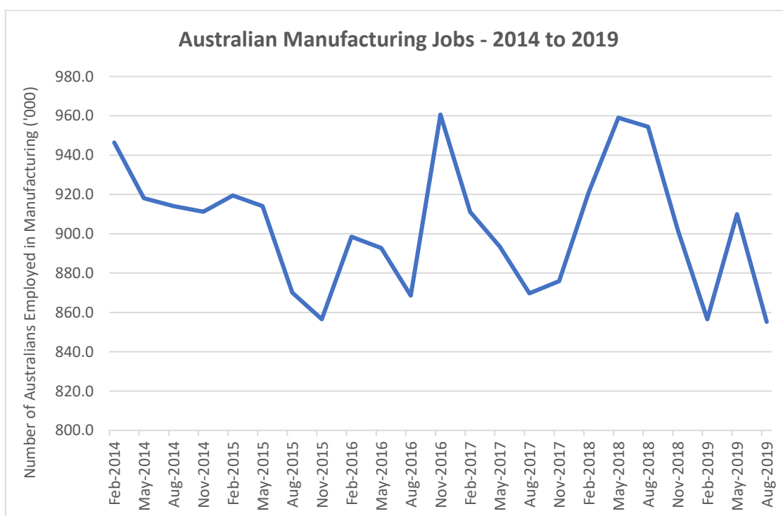
Table 2: ABS Labour Force Trend Data

Since 2014 the Australian manufacturing sector has contracted by approximately 100,000 workers or almost 10% of all manufacturing jobs (refer to Table 2). That this has aligned with rising gas prices is not pure coincidence.