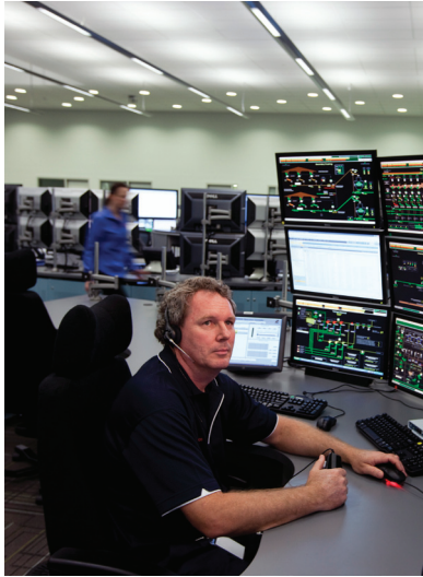
Mine of the Future

Rio Tinto is a strong supporter of the Extractive Industries Transparency Initiative (EITI) which was established in 2003. It has been developed as a multi-stakeholder initiative and includes in-country programmes as well as being governed through a global Board and Secretariat.