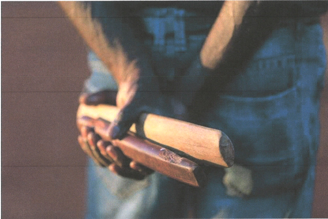
‘Uluru Statement from the Heart’ called for the establishment of a ‘First Nations Voice’ in the Australian Constitution (NITV)

informed Government that the substantive recognition we asked for through a constitutional Voice was a “take it or leave it proposition”.