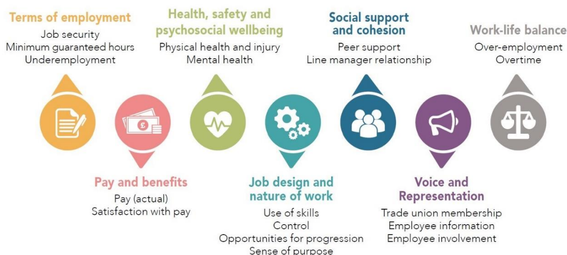
Figure 2: Job quality dimensions