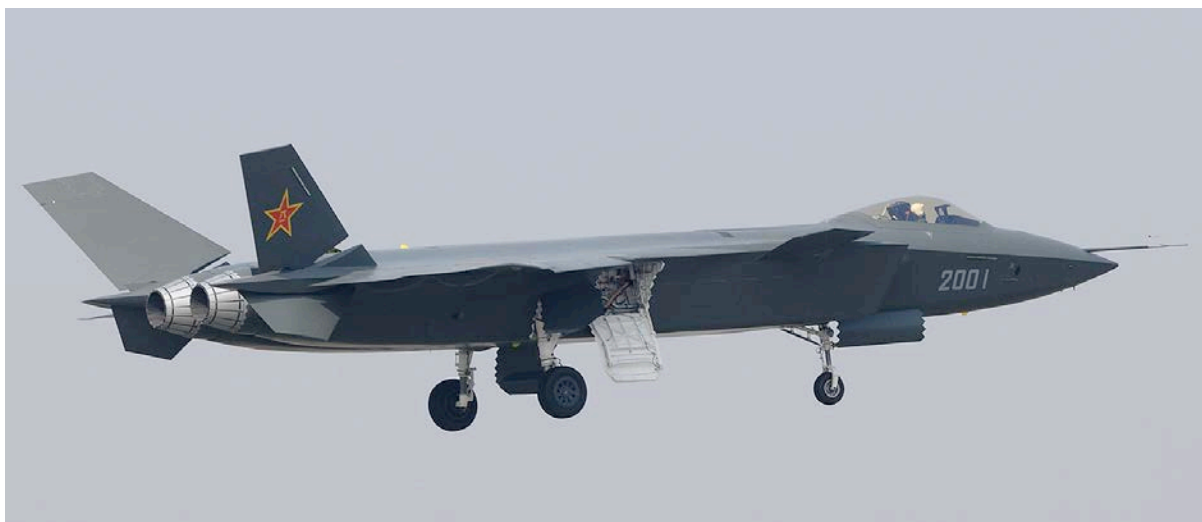
Prototype of the Chinese Chengdu J-20 supercruising high agility stealth fighter. The aircraft is now entering production, and was developed to compete with the US F-22A Raptor.