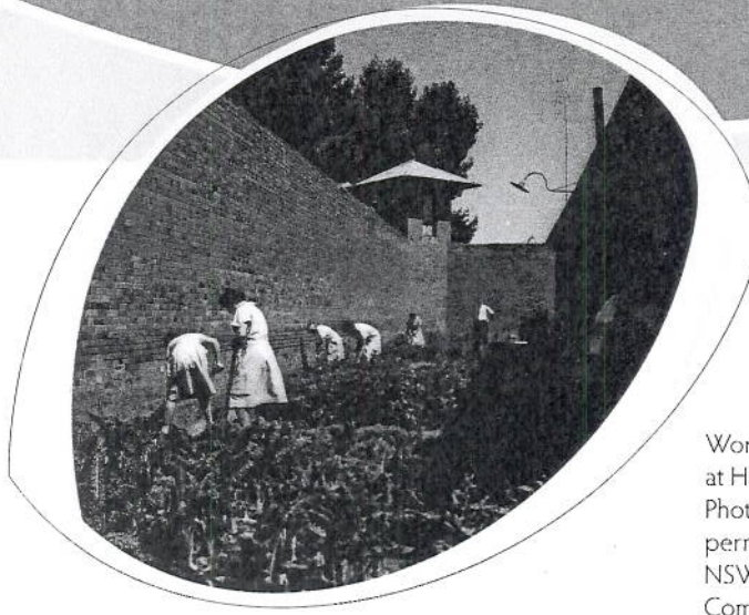
Working in the garden at Hay detention centre.